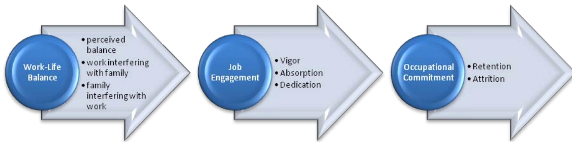
Figure 3. Proposed path analysis.