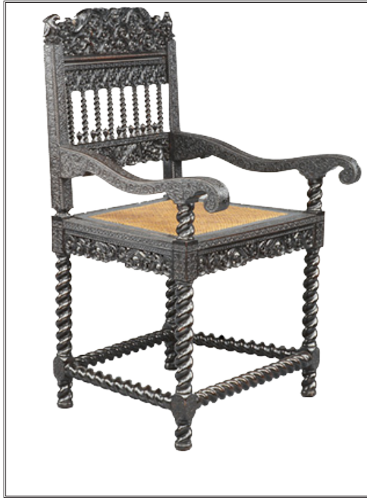
Exhibit 112. Armchair (ebony furniture). (Southeast India) Probably Coromandel Coast, India, ca. 1680-1720 Ebony, ebonized hardwood, ivory, ebonized walnut inner-seat frame with cane 42" x 24" x 19 1/2" (106.7 x 61 x 49.4 cm). J. Paul Getty Museum, Los Angeles.

The heavy traffic in ebony furniture, popular with various East India Company merchants, dates to the Coromandel Coast, southeast India, mid-seventeenth century. Ebony chairs and tables were durable and resilient, and also admired for their botanical motifs carved in relief.