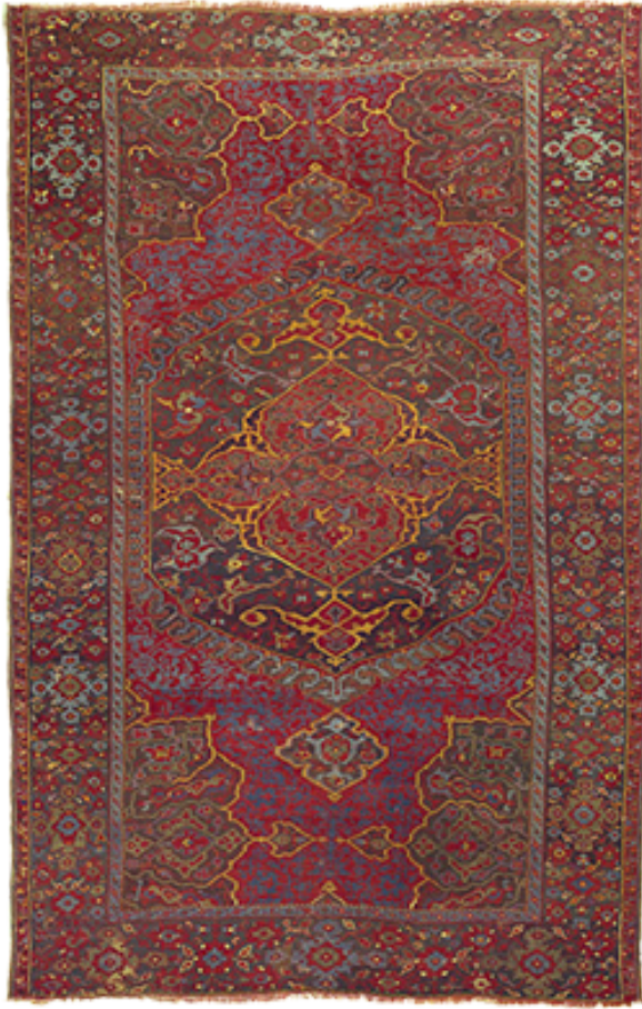
Exhibit 113. Luxurious Medallion Ushak Carpet (Turkey) Ushak, Turkey, 17th or early 18th century, wool and cotton, 144" × 92" (366 × 234 cm) The Colonial Williamsburg Foundation