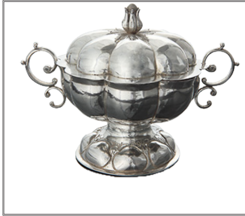
Exhibit 105. Silver Water Bowl, with Eight-lobes and Cover. (Batavia [Indonesia]) Batavia (present-day Jakarta, Indonesia), first quarter of the 18th century. Silver, 4 \frac{3}{4} " x 8 \frac{1}{4} " including handles. Marks: none. Collection: Gemeentemuseum, The Hague.

The inventory of Van Varick's personal effects and shop goods includes "three silver wrought East India cupps" which very likely may have resembled Exhibit 105, above.