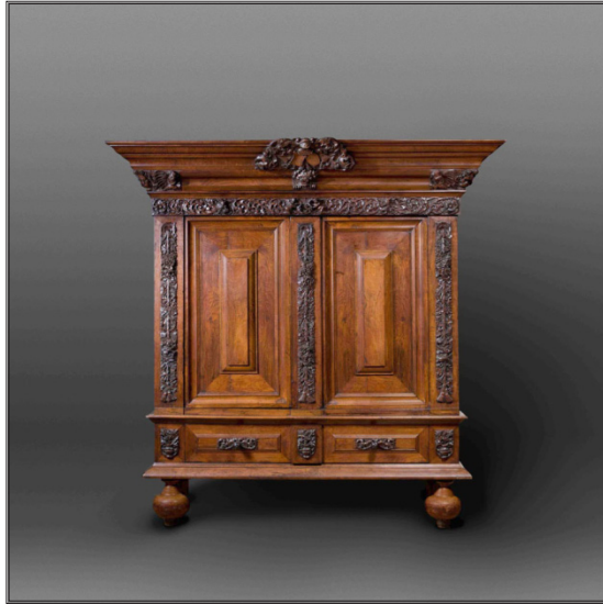
Exhibit 110. Kast. Dutch Republic, 1675-1690. (Netherlands) Walnut, Elm, Oak. 87" x 88 1/2" x 29." New-York Historical Society.