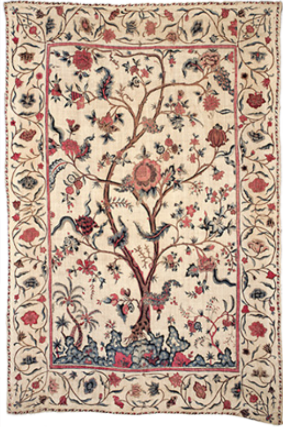
Exhibit 117. Palampore Wall Hanging or Bedcover (India) Southeast India, Coromandel Coast (present-day Andhra Pradesh), ca. 1720-40 Cotton, painted and mordant-dyed. 78 1/2" x 52 1/2" (199.4 x 133.4 cm) New York Historical Society (Object dating, courtesy Rosemary Crill, Victoria & Albert Museum, London).

This item shows “the craze for calico” (or chintz) during Van Varick’s time. These elaborately-patterned Indian cottons were hand-painted textiles, such as this specimen, and highly prized by merchants and upmarket consumers.