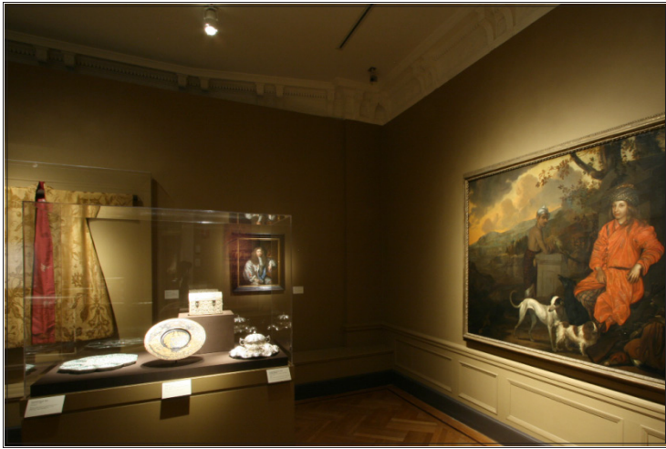
Installation View: Luxury Products from the Overseas Network