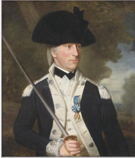
Exhibit 170. Richard Varick by Ralph Earl, 1787. (New York) Oil on canvas, 31 5/8" x 27 1/4." Albany Institute of History & Art, NY.

A descendant of Margrieta Van Varick, Richard Varick was a notable military and political figure in New York during the Revolutionary War. In addition to serving as the first transcriber of Washington's papers, he was Mayor of New York City, 1789-1801. Varick Street in Manhattan commemorates the contribution of the extended Van Varick family to New York's early history and political landscape.