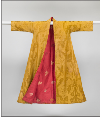
Exhibit 21. Man's Dressing-Gown, 58" long. (China; Persia) Cora Ginsburg LLC.

Lo! A popular style of fantastical and colorful man's gown, often worn as an outer garment wrap, reflecting multi-cultural / diasporic influences: Original design, in external layer of gold silk damask, likely Chinese. Lining, red brocaded silk, likely Persian. Collar and cuffs, red silk damask, English; wool padding L. (center back). 58" (147.3 cm).