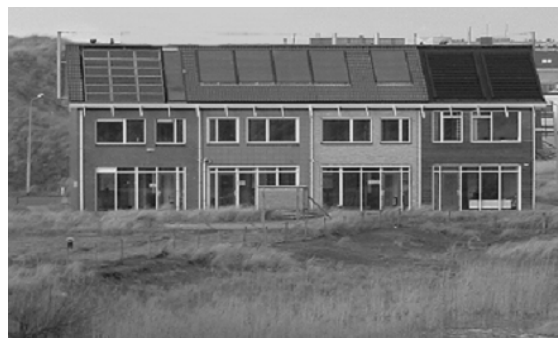
Figure 1: Above the four single-family dwellings

frame. Also different glazing and ventilation systems are applied: triple glazing systems with krypton gas filling to standard double glazing as well as balanced ventilation with heat recovery and natural ventilation are applied. Two dwellings are supplied with automated sun shading systems. Insulation value of the opaque facade and roof is 5 [m 2 · K/watt]. The rotating facility is placed in a watertight concrete 'basin'. Filling the basin with water will make the facility, which is built on EPS, float. This allows the facility to be rotated to any orientation. Four facades in the facility can easily be changed, allowing measurements with different facades on any desired orientation. Electricity use of inhabitants, domestic hot water use as well as their influence on humidity, carbon dioxide levels and temperature preferences in a dwelling, are simulated. A control system regulates electrical heaters to simulate heat of the metabolism of people and their electricity use for household appliances. Water vapour and carbon dioxide are injected to simulate evaporation and breathing.