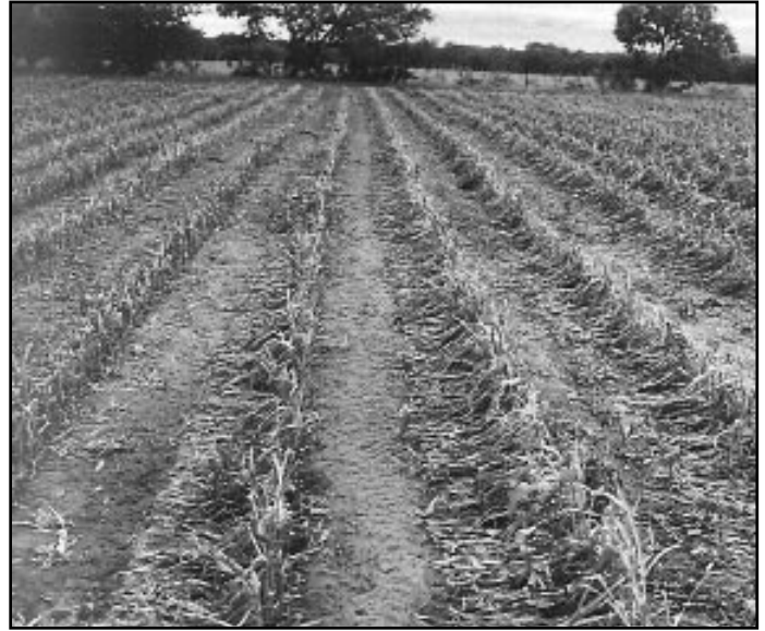
Hail damage to sorghum creates almost prostrate plants. Water loss will be extensive from the multiple breaks and bruises. Good soil moisture and sunny weather are important to the recovery of damaged stands.

Salvaging Older Hail- or Frost-Damaged Corn. If immature or wet, mature corn or sorghum is freeze-killed or severely damaged by hail and there is a use for silage, a silage chopper can be used to harvest the remaining erect plants. The chop can be placed in conventional silos, or it can be blown into commercial plastic silage-bags which are positioned on a smooth surface. The quality and nutritional value of the silage will be best when ears are present and grain has formed. Baseball-sized hail will breakout plant tops, bruise ears, and lodge plants. Most leaning plants can be recovered with a silage chopper.