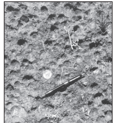
If the field is wet, quarter-sized hail can compact soil as well as shredding corn stands. It may be warranted to cultivate compacted fields to breakup compaction and to eliminate any surging weed competition.