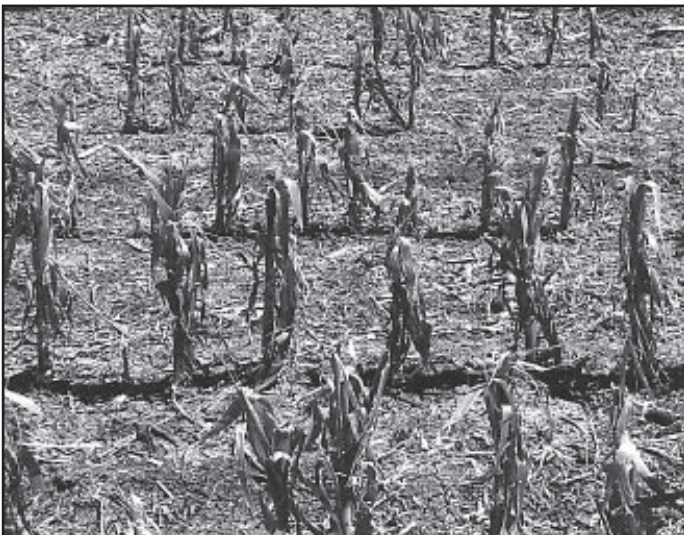
Ragged, hail-damaged corn plants exhibit various degrees and types of damage. Considerable leaf loss may be sustained with minimal loss of yield potential if corn is very young or is almost mature. Shredded leaves become wrapped around the remaining plant and initially restrict the emergence of new growth.

damage sustained. Fields receiving heavy rain are often crusted or compacted from the hail. If you