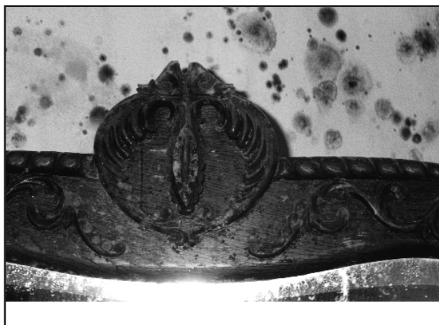
This antique bed and the wall behind it show significant mold damage.

The food source can be any organic material such as dust, books, papers, animal dander, soap scum, wood, particle board, paint, wallpaper, carpet and upholstery. When such materials stay damp (especially in dark areas with poor air circulation) mold will grow. Flooding, pipe leaks, leaky roofs, moisture in walls, high indoor humidity, condensation, and poor heating/air-conditioning system design and operation can create the damp environment mold needs to grow.