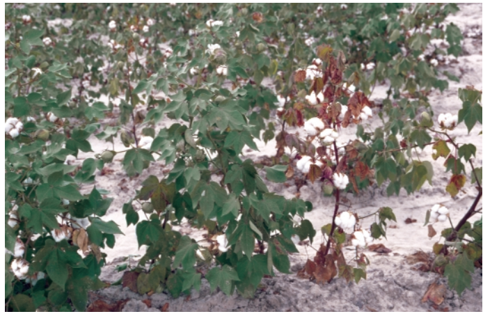
Figures 9 and 10. Stem and foliage necrosis and defoliation associated with bronze wilt.