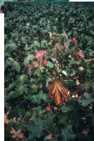
Figures 2, 3 and 4. Bronzing and reddening of foliage with bronze wilt.