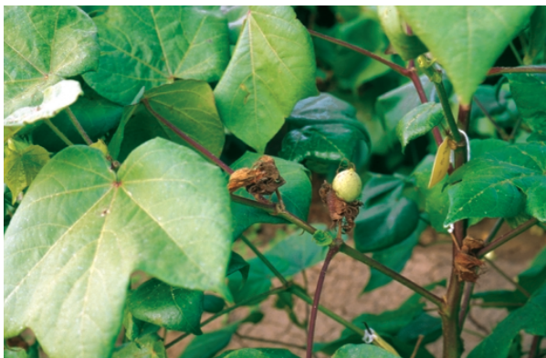
Figures 7 and 8. Bract and boll necrosis associated with bronze wilt.

causative agents. Brown scars left on taproots from the death of secondary roots are consistently infected with high concentrations of a unique strain of Agrobacterium tumefaciens . However, the bacterium is ubiquitous and can be found in roots and seeds of nearly all cotton plants regardless of symptoms.