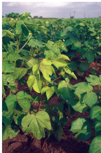
Figure 1. Chlorosis of foliage with bronze wilt.

The cause of bronze wilt is not certain. Both biotic and abiotic factors have been proposed as possible