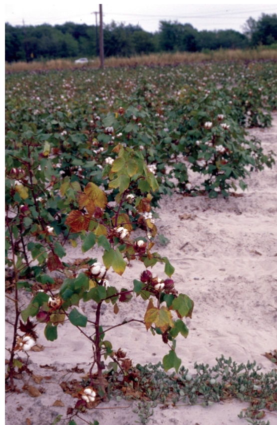
Figure 12. Plants at the end of a row affected by bronze wilt.

This publication was funded by Cotton Incorporated.