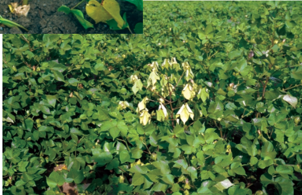
Figures 5 and 6. Wilt of foliage with bronze wilt.