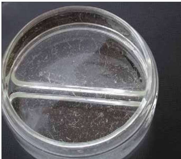
Figure 6. Worms flushed from an SDI system. Flushing twice a week solved the problem.

Back-siphoning is the backflow of water from the soil profile back into the tape at the end of an irrigation cycle. It is caused by a vacuum that develops as residual water in the tape moves to the lower elevations in the field. Back-siphoning may pull soil particles and other debris through emitters and into the tape. Figure 6 shows some live worms that were flushed from SDI lines during normal maintenance. It is thought that the eggs or cocoons of worms were pulled into the drip lines at the higher elevations in the field when zone valves were closed. Once in the drip lines, the eggs hatched and the worms started to grow. Worms and other contaminants were removed during normal flushing cycles (every 2 weeks).