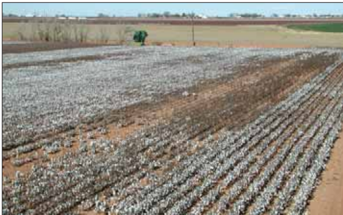
Figure 3. (Top) Plants in this field are drought-stressed because emitters are clogged. (Bottom) Acid injection can reduce clogging problems so fields are irrigated uniformly.