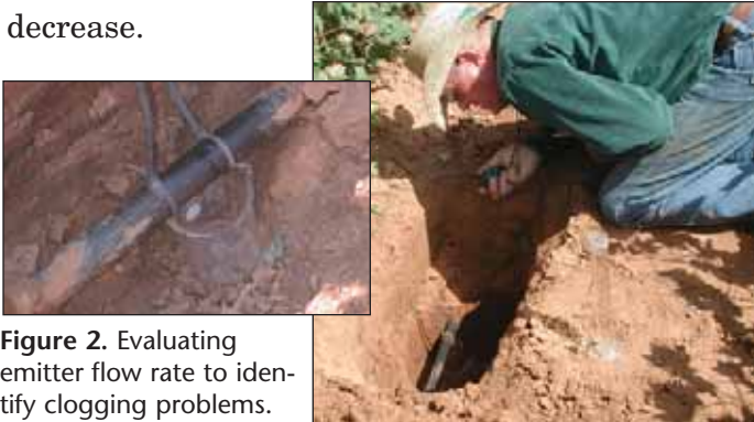
Figure 2. Evaluating emitter flow rate to identify clogging problems.

One way to evaluate clogging problems is to place a container under selected emitters as shown in Figure 2. The emitter flow rate (volume over time) collected at different locations should be compared against the design flow rate. The upper picture of Figure 3 shows a field where plants are stressed because emitters are clogged by manganese oxides. The general condition of a drip system can be easily evaluated by checking system pressures and flow rates often. If emitters become plugged, system pressures will increase and flows will decrease.