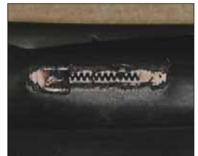
Figure 4. An emitter clogged by manganese oxides.

It is hard to eliminate iron bacteria, but it may be controlled by injecting chlorine into the well once or twice during the season. It might also be necessary to inject chlorine and acid before (upstream of) the fil-