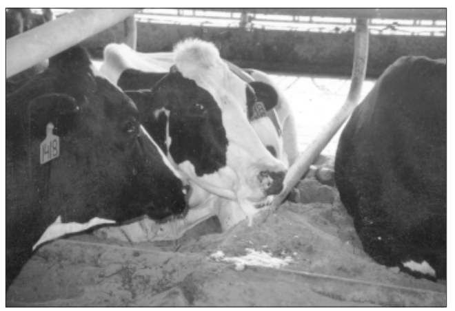
Heat stress is a seasonal factor that decreases dry matter intake and can affect milk production and composition.