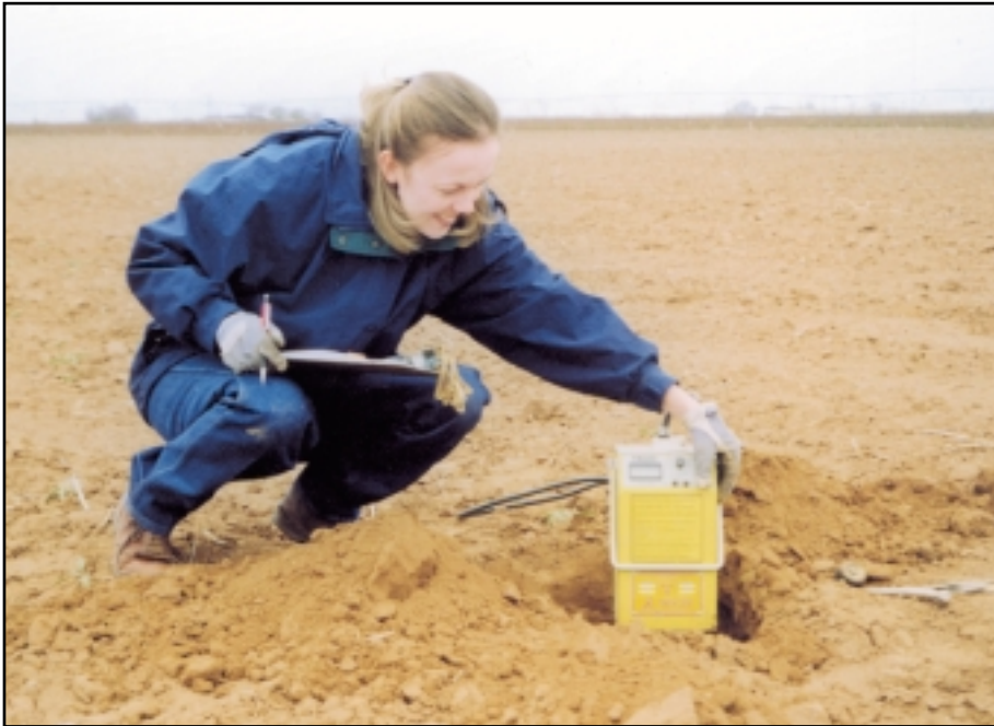
A moisture meter is used to collect pre-plant soil moisture data. This information helps producers know how much to irrigate before planting.

The Texas Water Code, Chapter 36, allows groundwater districts to levy property taxes to pay maintenance and operating expenses at a rate not to exceed 50 cents on each $100 of assessed valuation. Most district activities are funded through these ad valorem taxes, for which the maximum tax rates are set by local election. Districts surveyed reported ad valorem tax rates of $0.0045 to $0.0575 per $100 valuation. Hence, the annual tax paid on property valued at $100,000 ranges from $4.50 to $57.50.