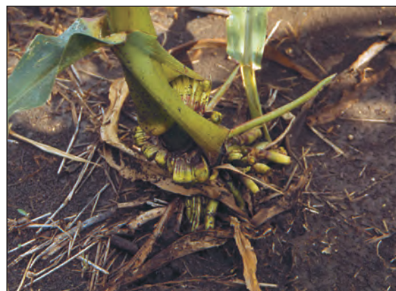
Dicamba injury to corn

Vapor from these products can easily drift to desirable plants, so they must be applied carefully. Equipment should be cleaned according to label instructions before it is used to treat susceptible crops with other herbicides.