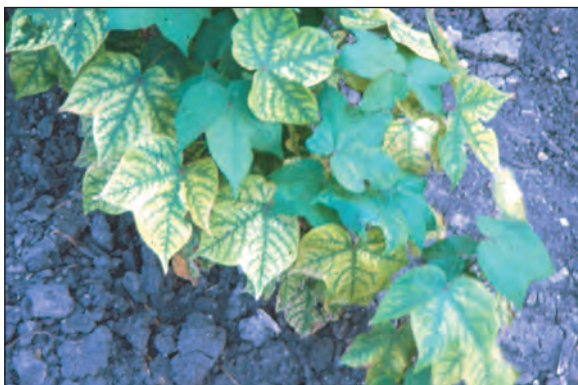
Triazine damage to cotton

Photosynthesis inhibitors are broadleaf herbicides.