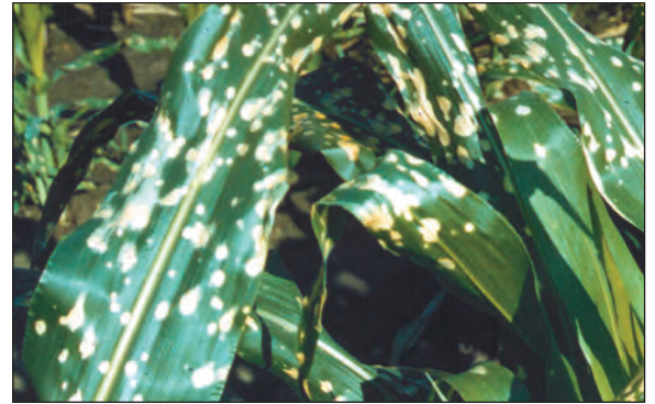
Paraquat drift onto corn

Plants rapidly turn yellow or pale and may look water soaked; then they dry up. The effects of the