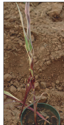
Fluzifop-P damage on corn

Leaves absorb these herbicides quickly and within an hour they cannot be removed by rain.