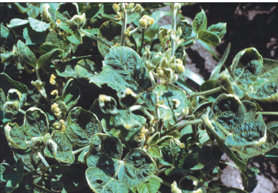
Growth Regulator Herbicides