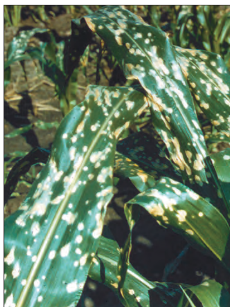
Cell Membrane Disruptors and Organic Arsenicals