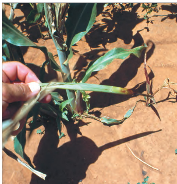
Lipid synthesis inhibitor damage to corn. Note rotted appearance at the base of the leaf stem.

Lipid synthesis inhibitors are unique because they act only on annual and perennial grasses, not on broadleaf plants. With the exception of diclofop, these herbicides are applied postemergence and have little or no soil activity. Crop oil concentrate or some other type of adjuvant must be used to increase herbicide uptake into the leaf. To be most effective, these herbicides should be applied to actively growing grass weeds. If grass weeds are stressed and slow growing, these herbicides will be less effective.