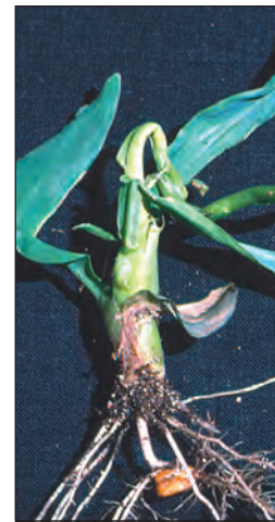
Acetamide herbicide damage to corn

If overapplied, they may inhibit growth of weed or crop seedlings.