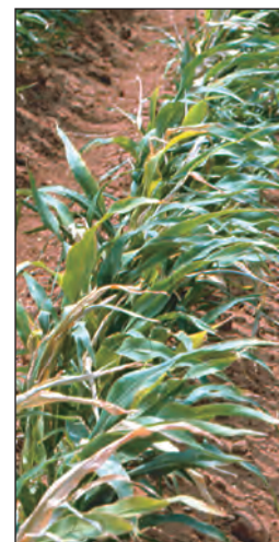
Glyphosate drift injury to sorghum

Because these herbicides are nonselective, it is very important to protect desirable plants from spray drift. These herbicides bind tightly to soil clay and organic matter and have no soil activity. For that reason they may be less effective when plants are dusty or when application water is dirty.