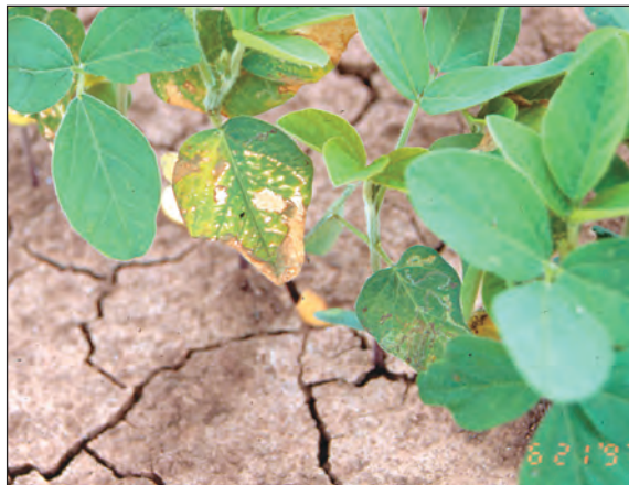
Metribuzin damage to soybeans