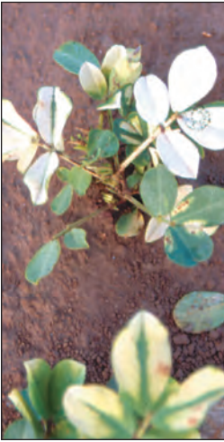
Clomazone damage in peanuts

These herbicides are often described as “bleaching herbicides.”