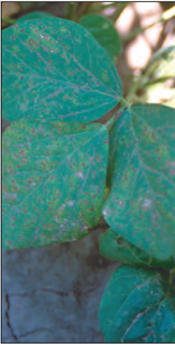
Diphenylether injury to soybeans

The effects of the bipyridilium herbicides are rapid.