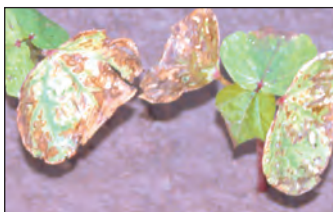
Triazine carryover damage to cotton

Soil pH higher than 7.2 can make injury from the triazine and triazone families more severe when used pre-emergence.