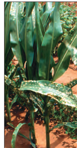
Bromoxynil damage on corn