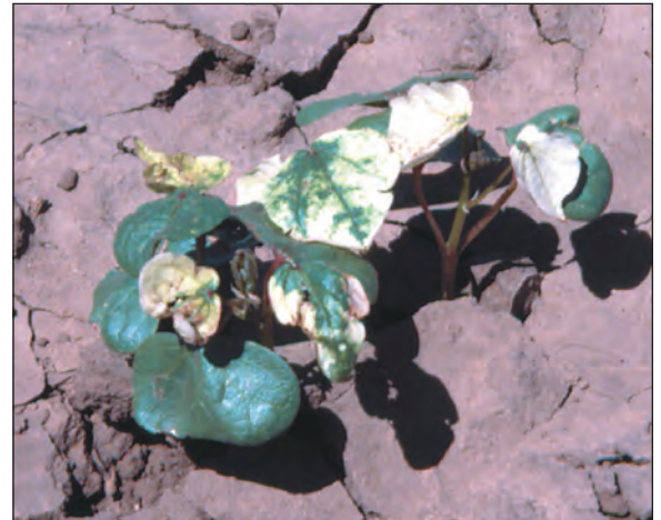
Clomazone damage in cotton

Injured leaves turn yellow or white, then often translucent. New growth is yellow to white with sometimes a hint of purple or pink. These symptoms can be found on cotyledons to the newest leaves of susceptible plants. Zorial® initially causes bleaching within veins; Command® initially causes bleaching between veins.