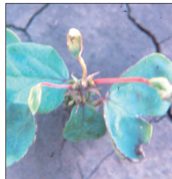
Sulfonylurea residue injury to cotton

When these herbicides are applied preemergence, symptoms do not usually appear until the plants have emerged from the soil. Symptoms for grasses include stunting, purple coloration, and root systems that develop a “bottle-brush” appearance. On broadleaf