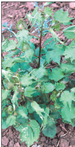
Phenoxy herbicide drift onto cotton

These herbicides are very versatile for weed control.