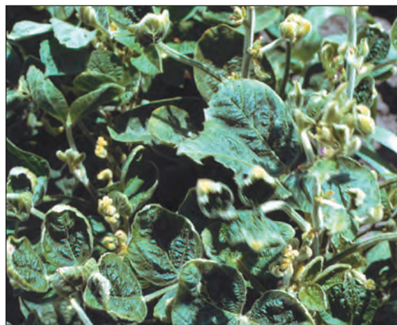
Dicamba drift onto soybeans