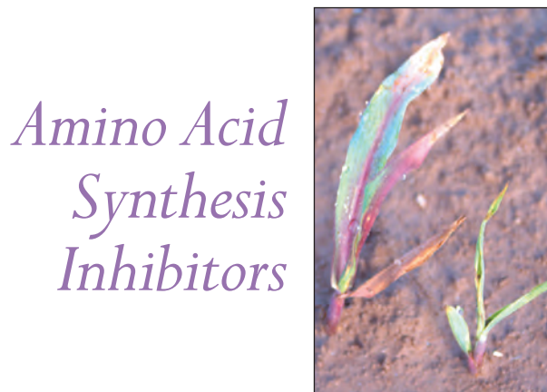
Amino Acid Synthesis Inhibitors