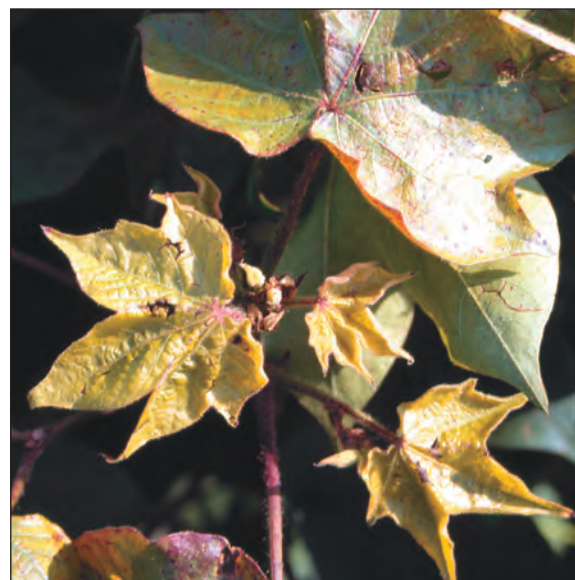
Imidazolinone carryover in cotton

Herbicides in this category are very crop specific. The spray tank must be cleaned thoroughly before the sprayer is used on a potentially susceptible crop. It is very important that the susceptibility of future rotational crops be considered before herbicides in this group are applied. High soil pH increases the soil activity of sulfonylurea herbicides and the potential for rotational crop damage.