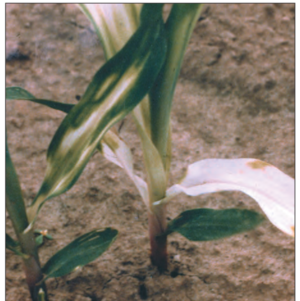
Norflurazon carryover damage in corn

In order to use Command® in cotton, an organophosphate insecticide (Thimet® or Di-Syston®) must be used in-furrow first. If the insecticide is placed incorrectly or applied at the wrong rate, cotton may be injured. Some formulations of Command® are volatile and should be used with care. Consult the label for further precautions.