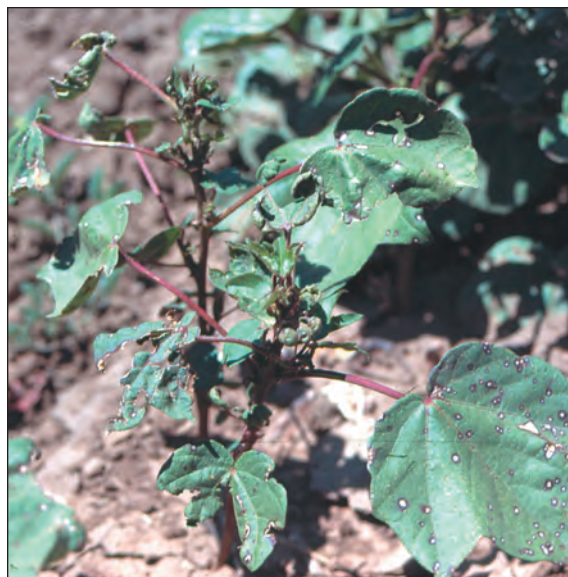
Glyphosate injury to cotton

Because these herbicides are nonselective, it is very important to protect desirable plants from spray drift.