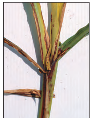
MSMA damage on Johnsongrass

Be careful to prevent drift during application so that nontarget plants are not harmed. Applying systemic herbicides shortly after cell membrane disruptors or organic arsenicals is not advised. Paraquat and diquat are generally considered to be nonselective and harmful to both grass and broadleaf vegetation. In peanuts, however, some selectivity can be achieved by using paraquat at the cracking stage. Another bipyridilium herbicide called Avenge ® is used in wheat and barley for selective postemergence control of wild oat.