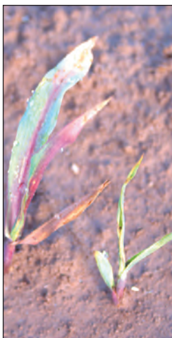
Imidazolinone carryover to corn

This new category of herbicides can be used at extremely low rates, controls both grasses and broadleaf plants, has soil and foliar activity, and is essentially nontoxic to mammals and most non-vegetative life forms.