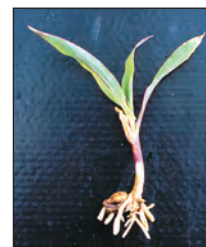
Dinitroaniline herbicide damage to corn seedling

If overapplied, they may inhibit growth of weed or crop seedlings.