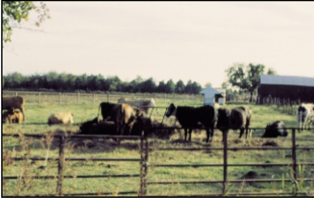
Calving in unclean areas exposes newborn calves to contaminated milk and feces.

in the environment, but can survive in the soil and water for more than a year because of resistance to heat, cold and drying.