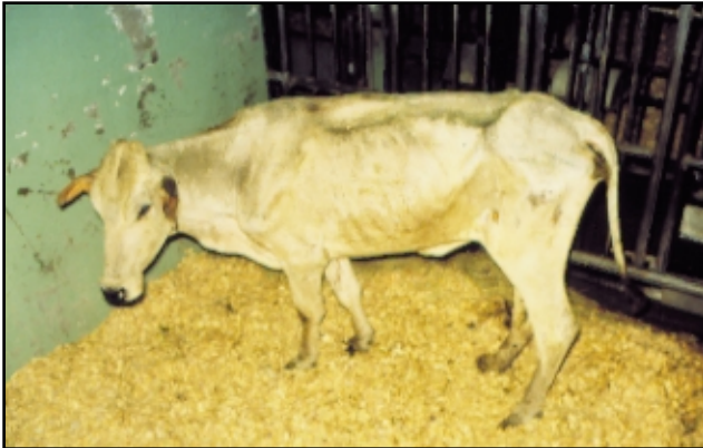
Paratuberculosis causes emaciation.

To control the disease in an infected herd, early detection and removal of infected cattle and protection of newborn calves from contaminated feces are vital. Nursing calves are to be raised on a clean, uncrowded pasture. There are no drugs for treatment or vaccines for protection against Johne's disease.