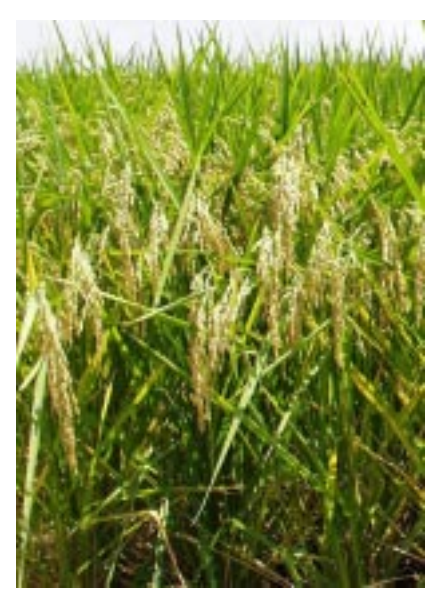
Hybrid rice has a 10,000 lb/ac first crop yield potential.

Thanks to the Texas Rice Research Foundation for providing support for this study.