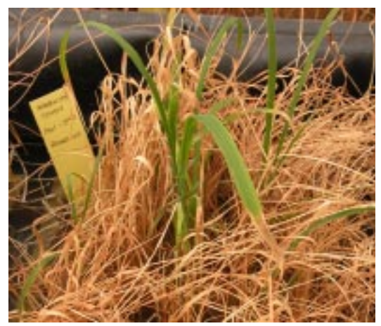
Test for herbicide tolerance showing one lone survivor.

Use of herbicide resistant crops is an important breakthrough in weed control. It offers a broader spectrum of useable herbicides, an option for in-crop weed control for enhanced herbicide rotation to delay selection for resistant weeds, better control of certain species like red rice, control of larger weed species, increased production efficiency and simplicity for the growers. However, currently a limited number of genes have been discovered for herbicide tolerance and these are all patented, thus gene discovery is continuing.