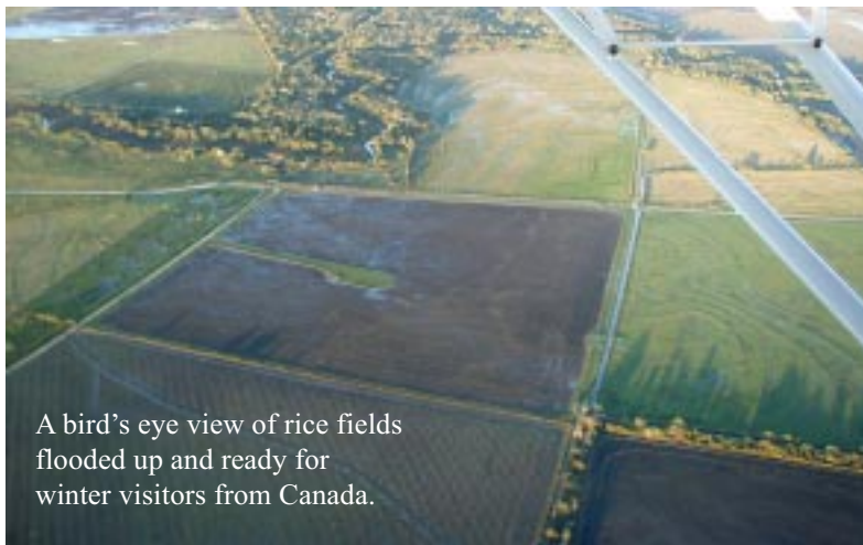
A bird's eye view of rice fields flooded up and ready for winter visitors from Canada.