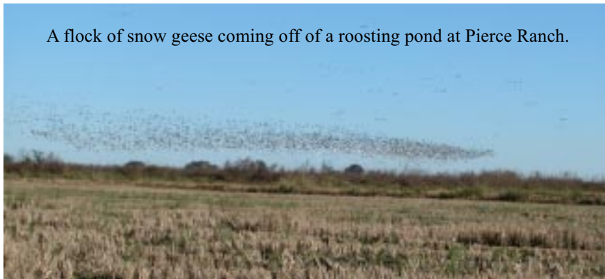
A flock of snow geese coming off of a roosting pond at Pierce Ranch.

wanted species, which allows native grasses to better compete. Laurance said this device is better than disking, because they can use it in fields with some standing water.