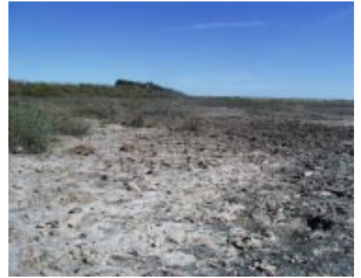
Side by side pasture land in Calhoun County. On the left is a project managed by Bill Stransky. On the right is land that was equally grazed, yet under a conventional system.

winter months by re-flooding their current years rice acreage, and leasing the land to duck and goose hunters. But this type of wetland management can still be cost prohibitive without the proper guidance and know-how.