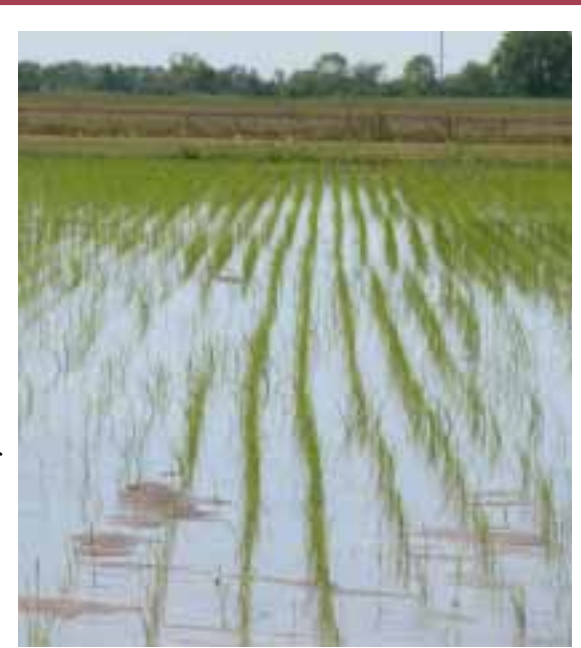
Establishing a uniform shallow flood is possible when fields have been laser leveled before planting.

Conservation Profiles . A conservation profile is a collection of field and lateral improvement options, as well as production and weather data needed to simulate water balance and carry out water use and economics analysis. To create a new profile, a user will click the Create Profile menu, fill