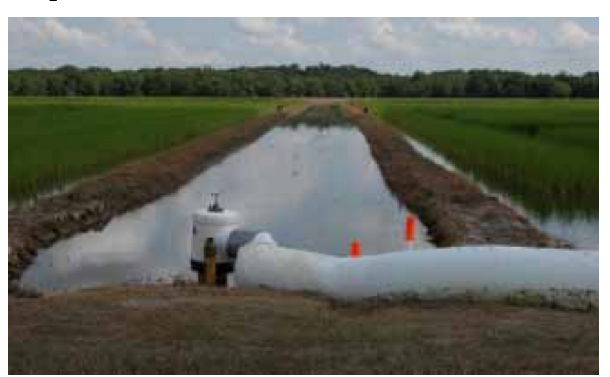
The poly pipe pictured above is often used for multiple inlet irrigation, which can conserve water and increase productivity.

Lateral Improvement. Lateral improvement involves the control of vegetation inside the lateral and on the lateral banks, and installation of underground pipe in place of lateral ditches. Vegetation control along the lateral ditches and on the surface of the water reduces water use that is normally lost through plant transpiration. In the course of a season, a heavy growth of weeds along a lateral will transpire as much as 40 inches of water. In extreme cases, where fast growing invasive plant species such as the Chinese tallow become established along the canals or laterals, a single tree can use as much as 500 gallons of water per day (LNVA, personal communication). Aquatic weeds that grow on the water surface not only account for a ma-