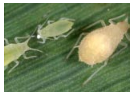
(Left) Aphid 'mummies' that have been parasitized by a beneficial wasp. (Center) Parasitic wasp laying an egg on an aphid nymph. (Right) Adult aphid infected with a fungus.