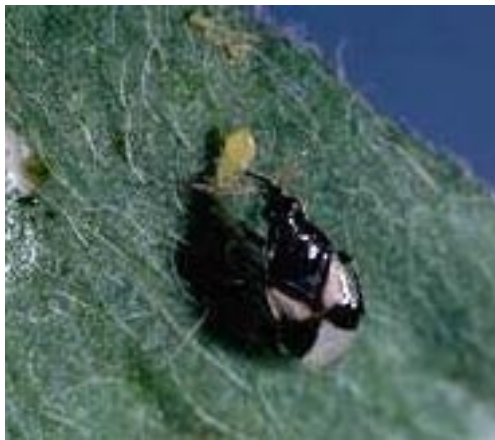
(Top) Minute pirate bugs feed by inserting their proboscis in the insect and sucking out the juices. Not so glamorous but highly effective. (Bottom) Thrips feed by piercing the individual cells and eating the contents. The minute pirate bug is a voracious predator that feeds on thrips.

On sorghum and rice, the caterpillars feed only on the ripening grain, consuming the contents of individual kernels and leaving the outside hull intact. Webworms spin cocoons and overwinter in the larval stage behind the leaves of the plant stalk sheath. The overwintering caterpillars begin to pupate when mean daily temperatures reach 57° to 59° F. The pupal period may last 5 to 9 days. The adults are nocturnal and live 10 to 20 days, during which time the females deposit an average of 88 eggs, singly, on protected areas of the flowering parts or seeds of the host plant. The population grows slowly up to the middle of the season, after which these insects increase rapidly. Development from the egg stage to the emergence of adult moths takes 24 days.