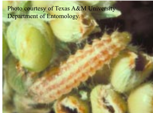
Sorghum webworm, with the hollowed out kernel that is typical of their feeding habits.

larval stages are transparent to light cream, whereas the mature larva is yellowish and cylindrical with a pair of pointed spiracles at the posterior end. The pupa is dark brown, subcylindrical, and the posterior end is tapering with two terminal respiratory spines.