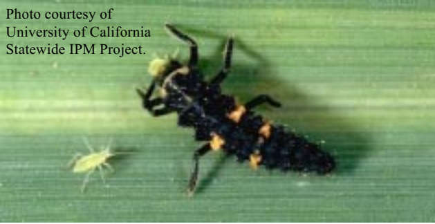
Pupa stage of the Ladybeetle, feeding on aphid nymphs.