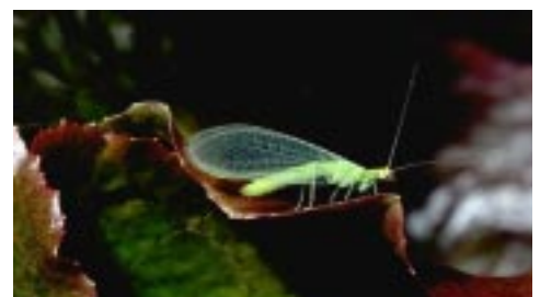
The green lacewing is an excellent predator of aphids, whiteflies and other soft bodied pests. (Left) Single egg on a delicate thread, usually found on the underside of leaves. (Center) Larva, commonly called the 'aphid lion', feeding on an aphid nymph. (Right) Lacewing adult, which also feed on aphids but also pollen grains.