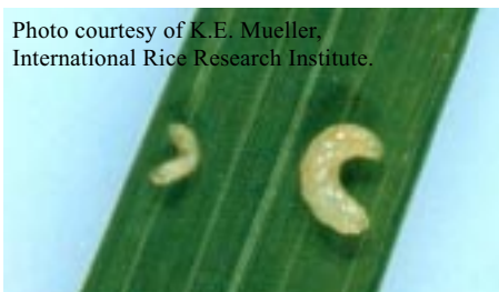
Rice whorl maggots are difficult to spot because they feed on unopened leaves.