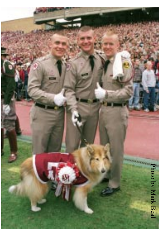
student body. With the goal of Cadets from E-2 Company are privileged with optimizing the college experitive responsibility of caring for Texas A&M's most treasured tradition, Reveille.

Being an active part of campus life is an integral part of the A&M experience. In fact, the number of students that do not actively participate in school activities is traditionally quoted as being very low, only around 2%. (Hence the term "Two