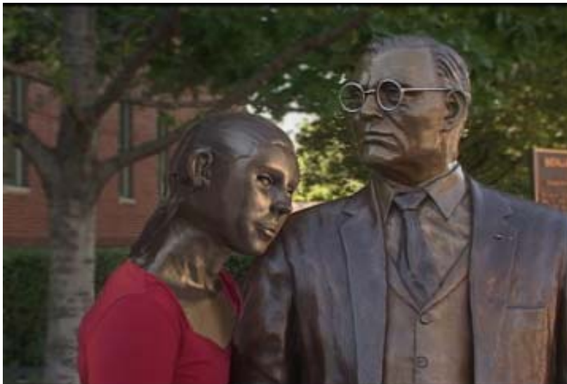
Figure 8: Digital Makeup – Final Composite.