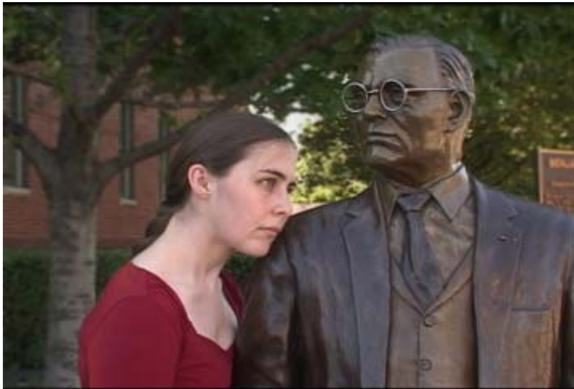
Figure 7: Personal Filming of Statue.