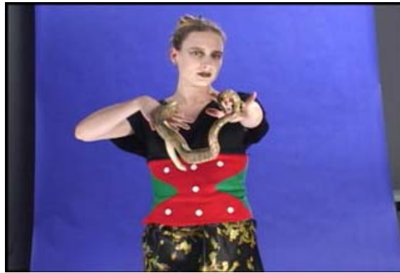
Figure 1: Personal Filming of Snake Charmer.