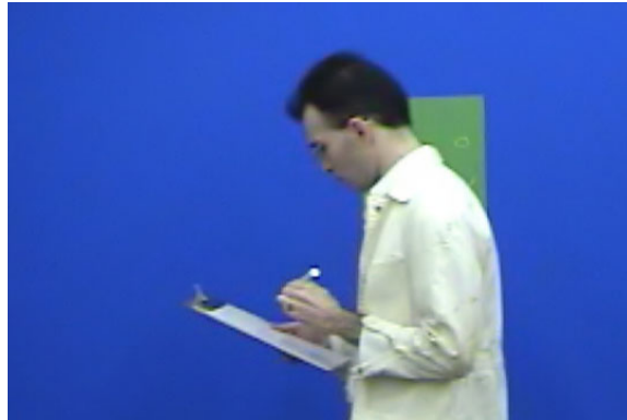
Figure 5: Personal Filming of Extra Scientist.