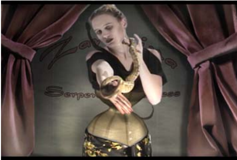
Figure 3: 3D Model into Live Action Film – Final Composite.