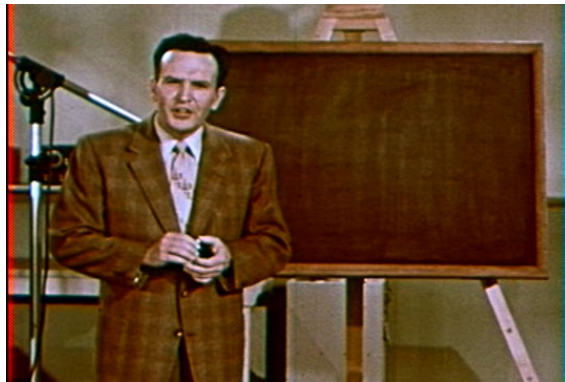
Figure 4: Original Footage – Mystery of Time (1957).

Matching the color palette was difficult, as the highlights of the lab coat had to be darkened to match the shirt of the original actor. I matched the red tones of the 1957 film and used masks to fix some problem areas. Some scratches were added and additional film grain was matched to the original footage as well. The color bar artifacts on the sides of the original screen were also duplicated to rest over the new footage and finalize the integration into the scene.