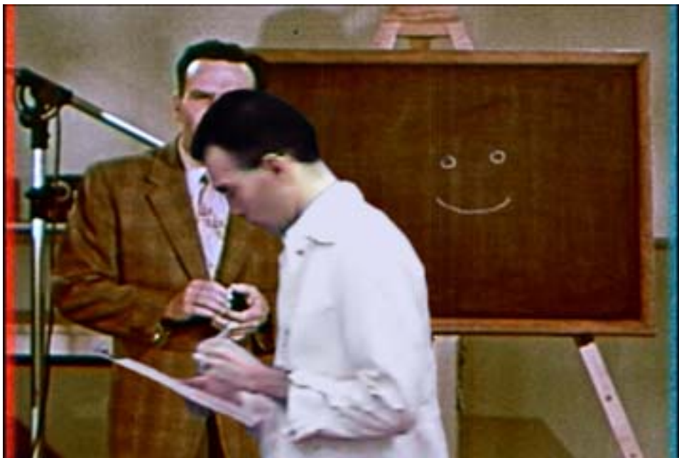
Figure 6: Pre-existing Footage – Final Composite.