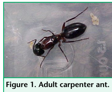
Figure 1. Adult carpenter ant.

black, yellowish red, or a combination of black, red and reddish orange. A carpenter ant has only one segment or node between the thorax and abdomen. It also has a circle of hairs at the tip of the