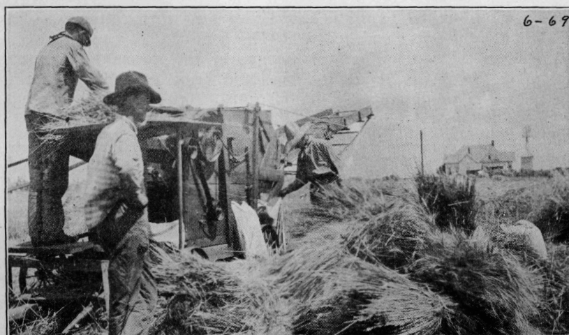
FIGURE 2—SMALL THRESHER USED IN THRESHING SMALL GRAIN FROM EXPERIMENT PLATS.

In Table XI it will be seen that the lack of tillage after plowing caused the early plowed but not cultivated plats to yield about the same as the late plowed and not cultivated plats, while the plats that were well cared for throughout the season made very good yields. This cultivation from July 15 until seeding time did not cost much, and the early plowing did not cost much more than later plowing, but the two taken together show a gain of at least 12 bushels of wheat to the acre.