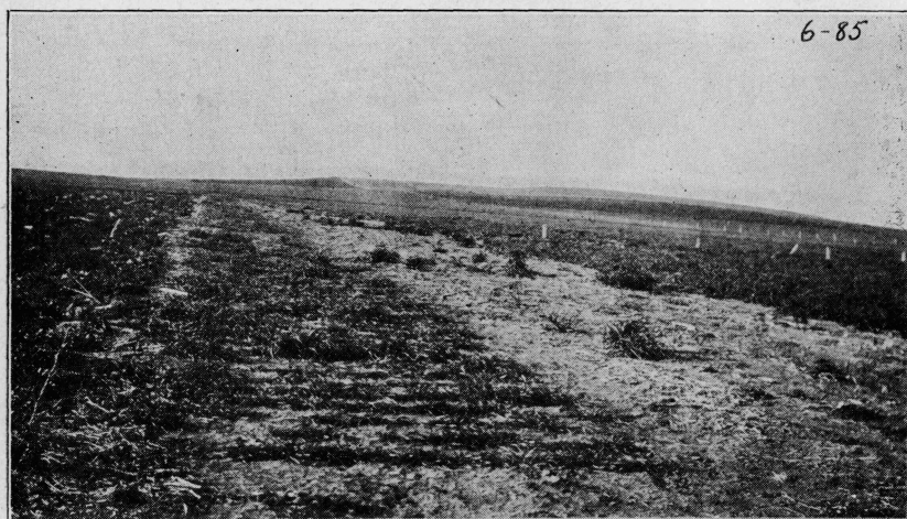
FIGURE 3—SMALL GRAIN NURSERY. THOUSANDS OF SELECTED PLANTS HAVE BEEN TRIED OUT IN THIS WAY.

Experiments with cotton have been conducted in the years of 1912, 1913 and 1914. In 1913 the number of tests with cotton was 100, and in 1914 the tests numbered 152. The work of 1914 was not successful, due to the wet spring and damage by the worms. The results secured in 1913 were poor, too, the land being spotted and not in good shape to produce good yields. In 1913 cotton gave better results