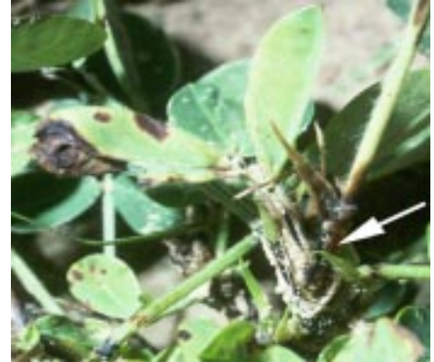
Blackened growth terminal

synthesis inhibitor herbicides are also contained in several premix packages (ex. Canopy, Finesse, Lightning). Peanut