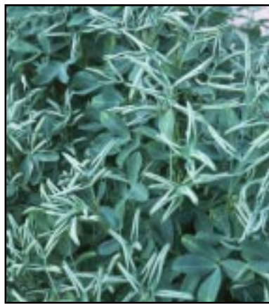
Grazon P+D carryover

Several tank-mix combinations of these herbicides are commonly used in pastures including Weedmaster (2,4-D + dicamba) and Grazon P + D (2,4-D + picloram). Typical injury symptoms of these herbicides include stem curling/twisting and leaf cupping/crinkling. When applications are made at excessive or above labeled rates to peanut plants that are beginning to set pods, they can also cause severe malformations of the pods.