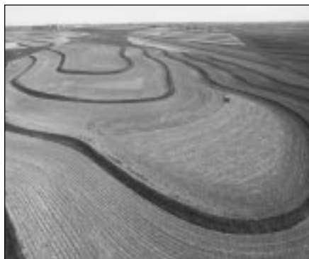
Ill. 5. Contour terraces

Terraces can be further sub-divided depending upon how they are constructed. Bench terraces, which are used widely overseas on very steep slopes, are the oldest type of