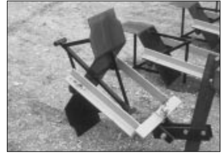
Ill 4. Paddle wheel diker

terraces. These stair-step type terraces are costly and are not used in commercial agriculture in the United States (Troeh et al., 1991). Graded terraces intercept runoff and any discharge is via a protected outlet or grassed waterway. Water can be diverted to a temporary storage basin or discharged off the farm. Two types of graded terraces are used in modern production agriculture. These are broadbase and narrowbase or grass ridge terraces. While graded terraces are an efficient tool for decreasing soil loss, they do not conserve water. The runoff collected by these terraces is transported to a grassed waterway or an underground outlet. Terraces that are designed to conserve runoff must trap the water in order for it to infiltrate into the soil (Troeh et al., 1991).