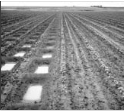
Ill. 1. Furrow diked rows adjacent to non-furrow diked rows