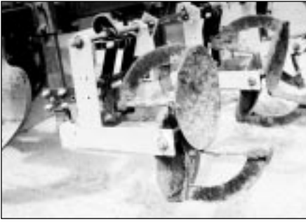
Ill 2. Hydraulic diker

Studies conducted throughout the state indicate that significant yield increases can be realized when diking is employed. For each additional inch of water stored in the soil, cotton lint increases 30 pounds per acre, grain sorghum yields increase 350 pounds per acre (Colburn and Alexander, 1986), and wheat yields increase by two and one-half bushels per acre (TWRI, 1984). Test results have shown from 16% to 147% increases in grain sorghum yields and 16 to 32% gains in cotton yields (Harris and Krishna, 1989). If widely practiced, it is estimated that diking would increase the total value of crop yields in the High Plains area by $87 million (TWRI, 1984).