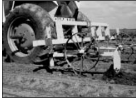
Ill 3. Wheel type diker

The main purpose of terracing is to prevent runoff of rainfall on sloping land, thereby limiting soil erosion and increasing water infiltration by collecting and storing runoff water (Ill. 5). Several types of terrace