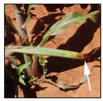
becomes very evident when the leaves are pulled from the whorl of the plant. In some grasses, a reddishblue pigmentation can be observed.