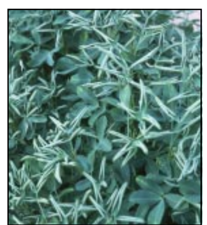
Grazon P+D carryover

Weedmaster (2,4-D + dicamba) and Grazon P + D (2,4-D + picloram). Typical injury symptoms of these herbicides include stem curling/ twisting and leaf cupping/crinkling. When applica-