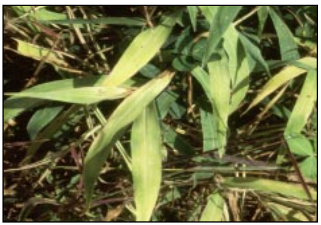
Yellowing caused by lipid synthesis inhibitor