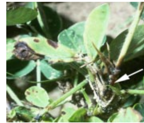
Blackened growth terminal

synthesis inhibitor herbicides are also contained in several premix packages (ex. Canopy, Finesse, Lightning). Peanut