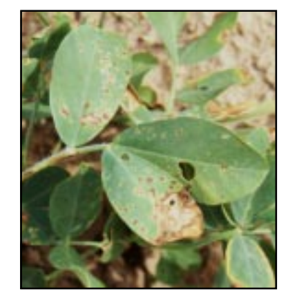
Poast Plus + Crop Oil

vant. Under certain conditions (i.e., hot and humid), the crop oil can cause injury in the form of a leaf burn or spotting. Symptoms of lipid synthesis inhibitor herbicide injury on susceptible grass plants include