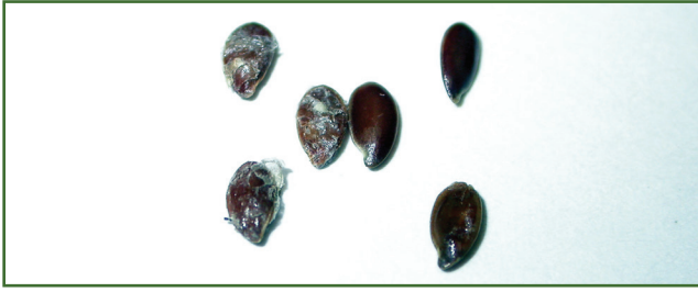
Fig. 10. Weathered flaxseed (left) due to exposure to wet conditions before harvest.

Flax harvested for seed must be handled more carefully than most other crops because cracking frequently reduces germination. Concaves and cylinder speed should be adjusted as frequently as necessary to prevent cracking and injuring the seed. Yellow-seeded varieties are more susceptible to seed damage because of their thinner seed coat. To minimize damage, rubber roller attachments are available for harvesting planting seed. Flax seeds are small and slippery, so equipment and storage facilities must be free of holes and cracks. As with other high oil content crops, storage time should be minimized.