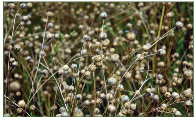
Fig. 9. Flax at harvest time.

Begin harvesting flax only when the bolls and upper plant parts have turned brown and the straw is yellow (Fig. 9). Flax can be harvested safely at moisture levels up to 18 percent, but seed with more than 8 percent moisture must be dried before storage. Harvesting flax at a high moisture content, while some bolls and plants are immature, can result in dockage at the selling point.