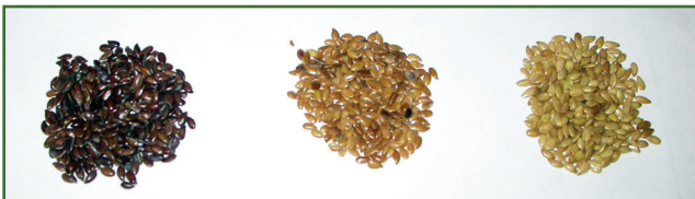
Fig. 8. Brown-seeded (left) and yellow-seeded flaxseed (center and right) (photo by Daniel Hathcoat).

Flax is a self-pollinated crop, and the seed is produced in a boll or capsule. A complete boll can have ten seeds, although the average is about six. Seeds can be brown, golden or yellow (Fig. 8). Yellow-seeded varieties are more susceptible to seed decay and seed damage because of their thinner seed coat. For this reason, yellow-seeded varieties usually have less seedling vigor. Most flax varieties have blue flowers, though some have white flowers.