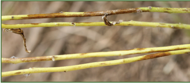
Fig. 3. Pasmó symptom: brown bands on stems alternating with green bands.

Control: Rotate crops and plow under crop residue. Some varieties are more tolerant to the disease than others.