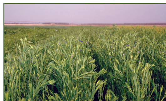
Fig. 1. Flax at early bloom growth stage.