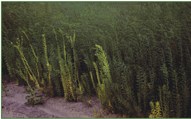
Fig. 7. Plants with aster yellows.

Control: There are no resistant varieties.