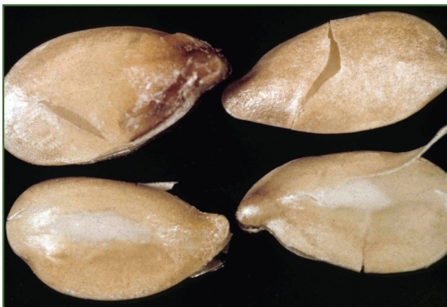
Fig. 4. Cracked seeds are more prone to infection by fungi.

Control: Use high-quality seed treated with fungicides. Do not plant seed any deeper than necessary and provide a firm seedbed