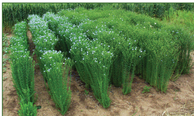
Fig. 2. Impact of planting date on flax flowering and maturation. Planting dates of Nov. 8, Nov. 30, Dec. 4, Dec. 18, Jan. 3, Jan. 18, Jan. 30 and Feb. 15 from right to left. Picture taken on April 4, 2008 in College Station.

Sow flax early enough that the plants will become well established before freezing temperatures occur. After plants have branched at the crown, cold-hardy varieties can withstand much lower temperatures without serious injury. Avoid sowing flax too early in the fall, or late spring frosts may damage the crop at the bloom stage. In South Texas, when moisture conditions permit, plant between November 10 and December 10. In this area, flax seeded after January 1 usually produced lower yields than December seedings. If moisture is available, October 15 to October 30 is an ideal time for planting flax in the Temple area. See Fig. 2 for an example of the effect of planting date on flowering date.