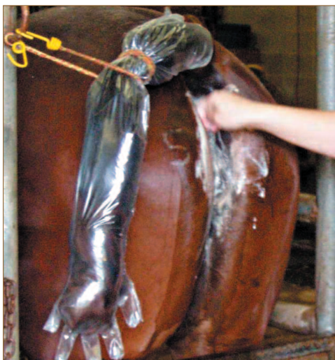
A mild soap can be used to wash the perineal area of the mare prior to insemination.