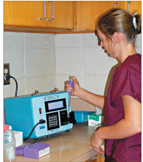
Evaluation of spermatozoal concentration in an ejaculate with the Densimeter®.

To calculate an insemination dose, the concentration of spermatozoa in the ejaculate must be determined. Several instruments are available for this determination with a wide range of costs and capabilities. The least expensive is a hemacytometer, used with a microscope to count actual cells. The most widely used instrument is the Densimeter® (Animal Reproduction Systems, Chino, CA), which can also calculate the insemination dose. Several other less expensive sperm counters are reliable for determining spermatozoal concentration, but they have fewer features than the Densimeter®.