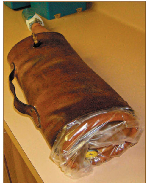
Missouri model artificial vagina (distributed by NASCO) being prepared for collection.

Collecting the semen is the next step in the AI process. If some time has elapsed between washing and collection, the stallion may have to be teased again to attain an erection. He should be led in