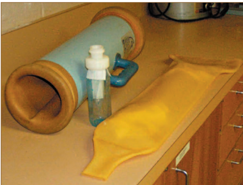
CSU model artificial vagina.

There are two primary equine artificial vagina (AV) models that are popular and easy to use. Choose the model that is acceptable to the horse and maintains semen viability during the collection. The Missouri Model AV (NASCO, Ft. Atkinson, WI) is comparatively lightweight and flexible. However, it does not maintain temperature very long and if there is much delay between AV preparation and semen collection, the AV temperature may be too low for successful collection. The Colorado Model AV (Animal Reproduction Systems, Chino, CA) is more rigid and heavier but better maintains a consistent temperature, even when used outdoors.