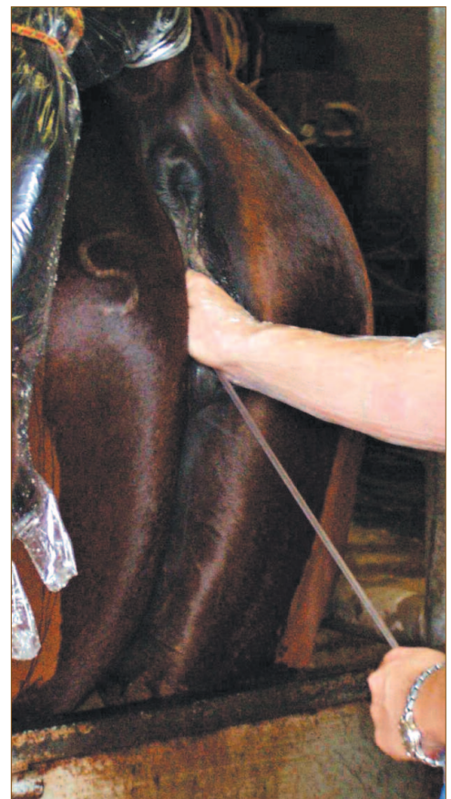
After insemination, the hand should be slowly withdrawn in a downward motion to prevent aspiration of air into the vagina.