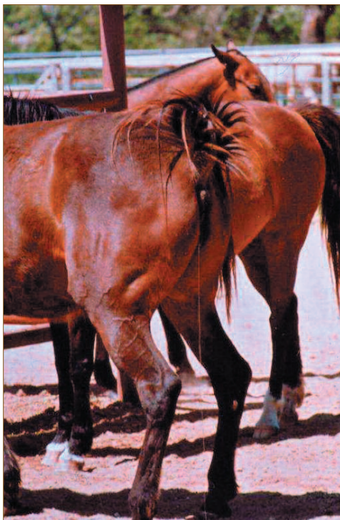
Characteristic signs of intense estrus: lifting tail, squatting (posturing) and urination.

show behavioral estrus. Anestrous mares typically go through a lengthy transitional period in late winter and early spring as they re-enter the breeding season (long days). During this season, the mare's estrous cycle consists of two phases — estrus, when she is receptive to the stallion, and diestrus, when she is disinterested or even negatively aggressive toward the stallion. These phases are governed by hormonal activity and the influence of hormones on the reproductive structures.