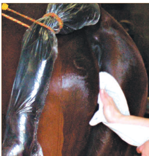
Water is spermicidal so it is suggested that the mare be dried before insemination.

Once semen parameters have been established, the semen should be diluted with an extender containing antibiotics to maximize its longevity and decrease the growth of bacteria in the semen. Dilution ratios of 1:1 to 1:4 parts semen to extender can be used. Semen should be evaluated for motility again after it is diluted.