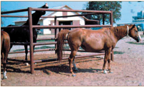
Estrus in mares can be detected by placing a stallion in a holding pen while the mares are allowed to exhibit behavioral signs without the influence of a handler.