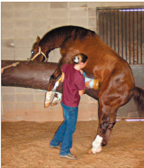
Semen collection into a CSU model AV using a phantom. Note the position of the AV during the collection.

Caution: Stallion handling and semen collection should not be attempted by persons not experienced in handling horses. It should always be done under the direct supervision of an experienced and knowledgeable person who understands the procedure very well.