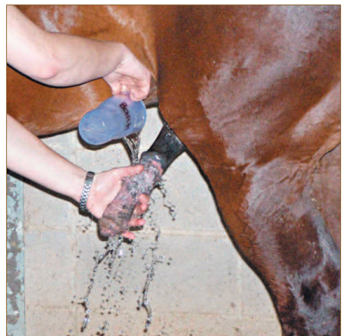
The washing process serves to clean the penis and prepare the stallion for the semen collection. The stallion should not be handled roughly during washing.