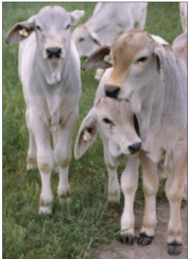
If it is not possible to weigh calves, estimate the projected market weight by using an average daily gain for calves of 1.8 to 2.0 pounds per day.

Appreciation is given to Dr. L.A. Lippke for his comments and editorial suggestions regarding this document.