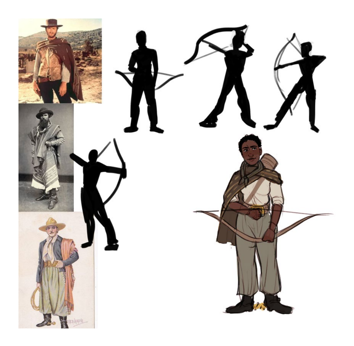
Figure 2.3.1.4: Examples of applying references to silhouettes for the Determined Widow archetype. Here, I've put emphasis on determining a pose that best represents her personality.

Manifest features five primary characters who are members of the Grimsbank Caravan, a moderately financed and highly unqualified group of individuals trying to strike it rich in the West. These shapes and visuals I will be using will ultimately help convey the personalities of the characters, which are based on the Shopkeeper, Undertaker, Drifter, Kid, and Determined Widow archetypes.