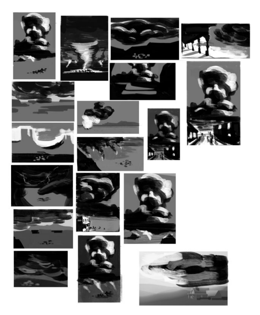
Figure 2.3.1: Thumbnails of my setting. Large, dark clouds can be seen rolling over the desolate landscape. Although I did not end up creating environment pieces as a part of my final artifact, these thumbnails helped me visualize the world and assess how my character designs would be influenced by the environment.

in their enormous, bulbous forms. Beyond the environmental hazards, the appearance of spills has also brought out the worst in humanity. Many folks have migrated to the West chasing their greed and, although not all of them are unsavory, crime has increased over the years. Whether of good or bad intentions, these individuals have come from all across the state to form caravans and hunt down these creatures for the potential to bring about a new life for themselves – if they survive the journey.