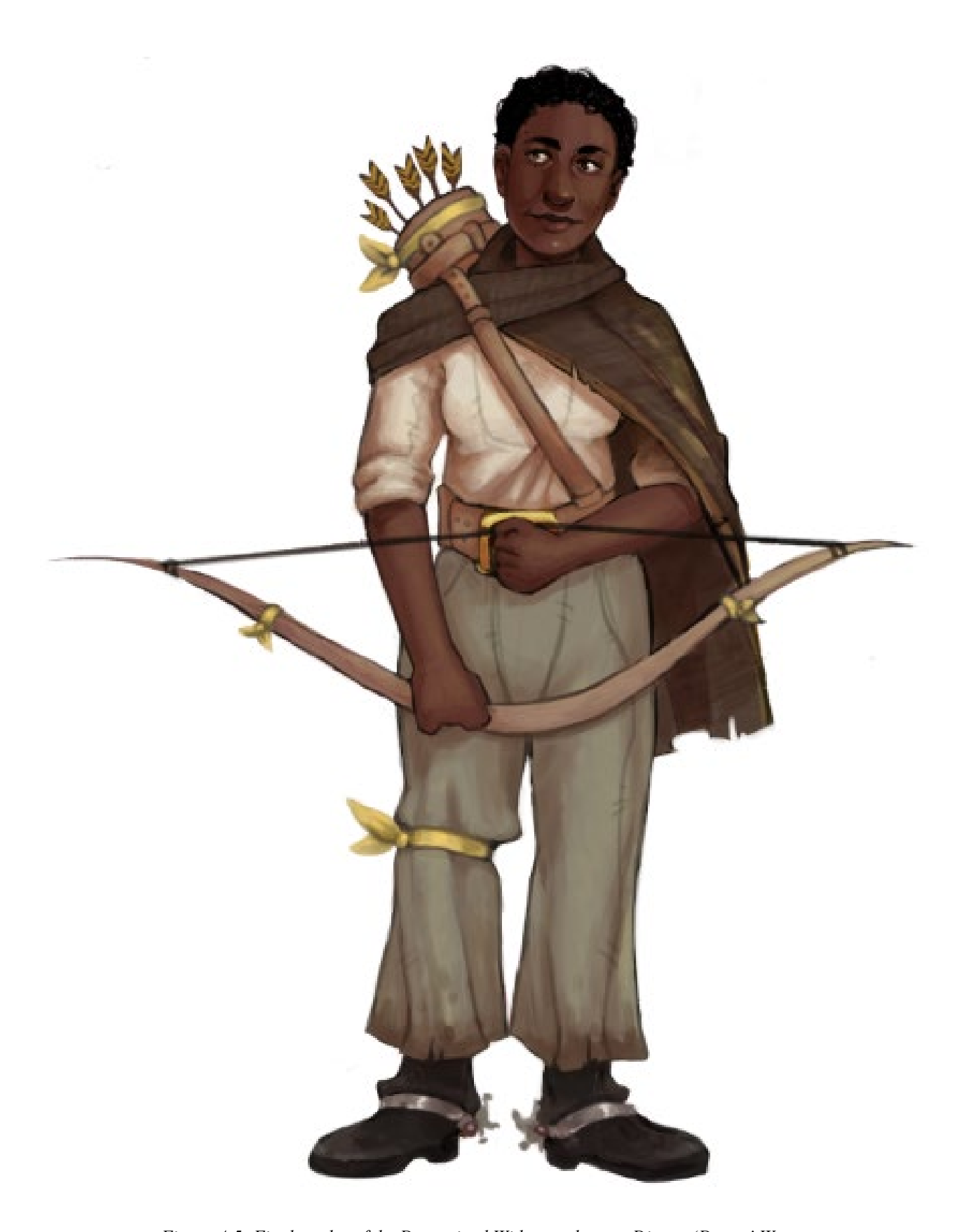
Figure A.5: Final render of the Determined Widow archetype, Dianne 'Danny' Wes.