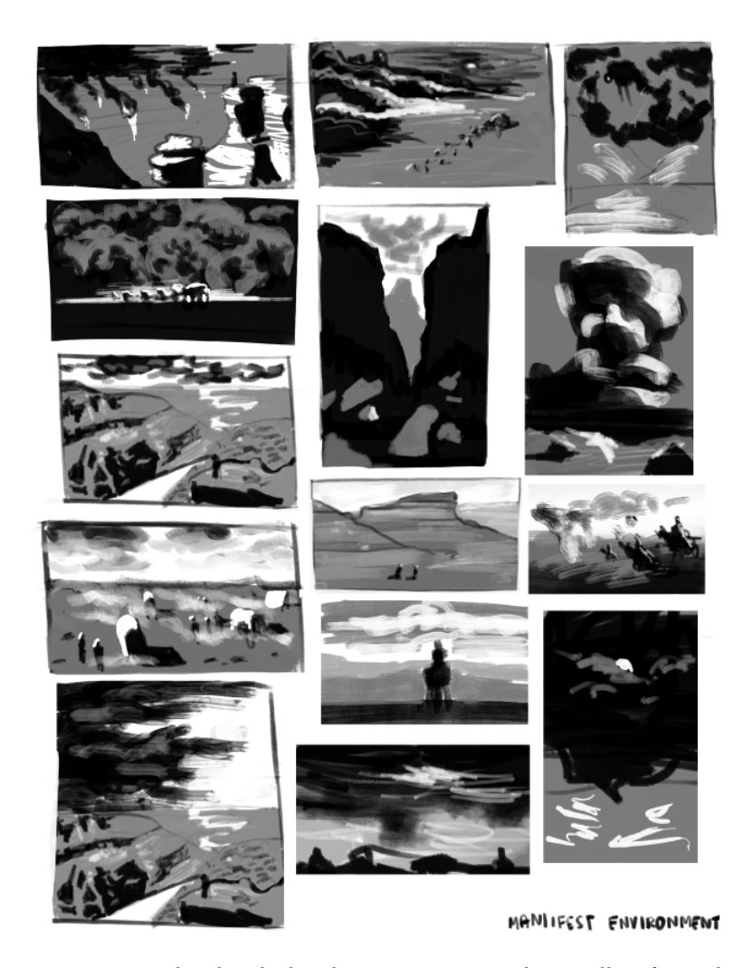
Figure 2.3.2: More environment thumbnails that depict caravans tracking spills. I focused on capture the size difference between the slicks and the looming clouds above them, emphasizing danger that comes with hunting these gigantic, otherworldly beasts.

With a better understanding of how caravans function within Manifest , equipment and other items that are common in the western genre must be reviewed to determine whether or not they work within my world. With the prevalence of oil through spills , and the uncertainty surrounding them, fire has been made illegal. This presents one of the first major changes from historical events. Changes to history require the viewer to see results that are explainable within the context of the world, so the impact of fire being banned would need to be blatantly apparent. Where cowboys used firearms in the 1800s, cowboys in Manifest are forced to use crossbows, harpoons, or bows. Equipment such as holsters have been modified to accommodate these new