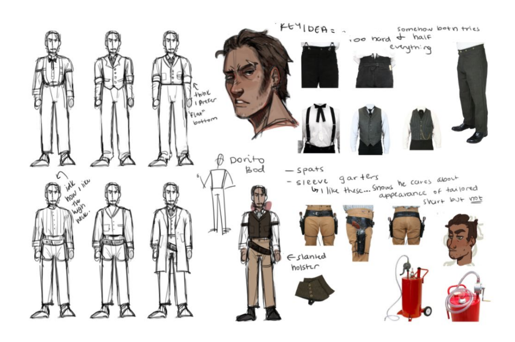
Figure 2.3.1.3: Examples of applying references to preliminary sketches to the Drifter archetype. Here, I've already determined his shape language and personality, and now focusing primarily on the character's clothing. By using these references, my character takes on the appearance of a western protagonist, fitting within the visual expectations of the viewer.

The primary I used to make my characters were rectangles, triangles, and circles. Each of these shapes elicit specific feelings when applied to a character design, and can also vary depending on the context in which it is used. Triangles can represent instability or femininity, while rectangles are sturdy. Circles and their bounciness depict a playful feeling into a design. Overall, intentionally using shapes is important when creating a silhouette in order to make their personalities clear from the moment a viewer sees them.