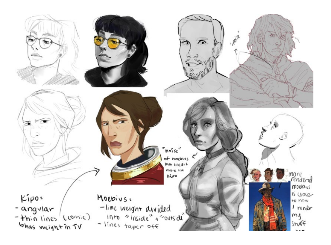
Figure 1.2.1: My preliminary work exploring the art style that I wanted to capture in my art. Specifically, I was examining how line weight is used within Blueberry and how I could combine that with my personal art style.

Additionally, I will use archetypes and costumes from western movies to help mold the appearance of my characters. I will make five of these character designs, and will discuss the characteristics of each individual design and how they relate to the research I conducted. Specifically, I provide reasoning behind each major visual decision made for my characters and how they relate to their historical context, archetype, and personality. The art style I will be using as my inspiration is the work of Moebius, primarily his comic series Blueberry , which follows a group of characters in the American West during the late 1800s. Although I will not directly imitate his work, I will be referencing how Blueberry depicts its subject matter in its shapes and varied line weight (Charlier and Giraud).