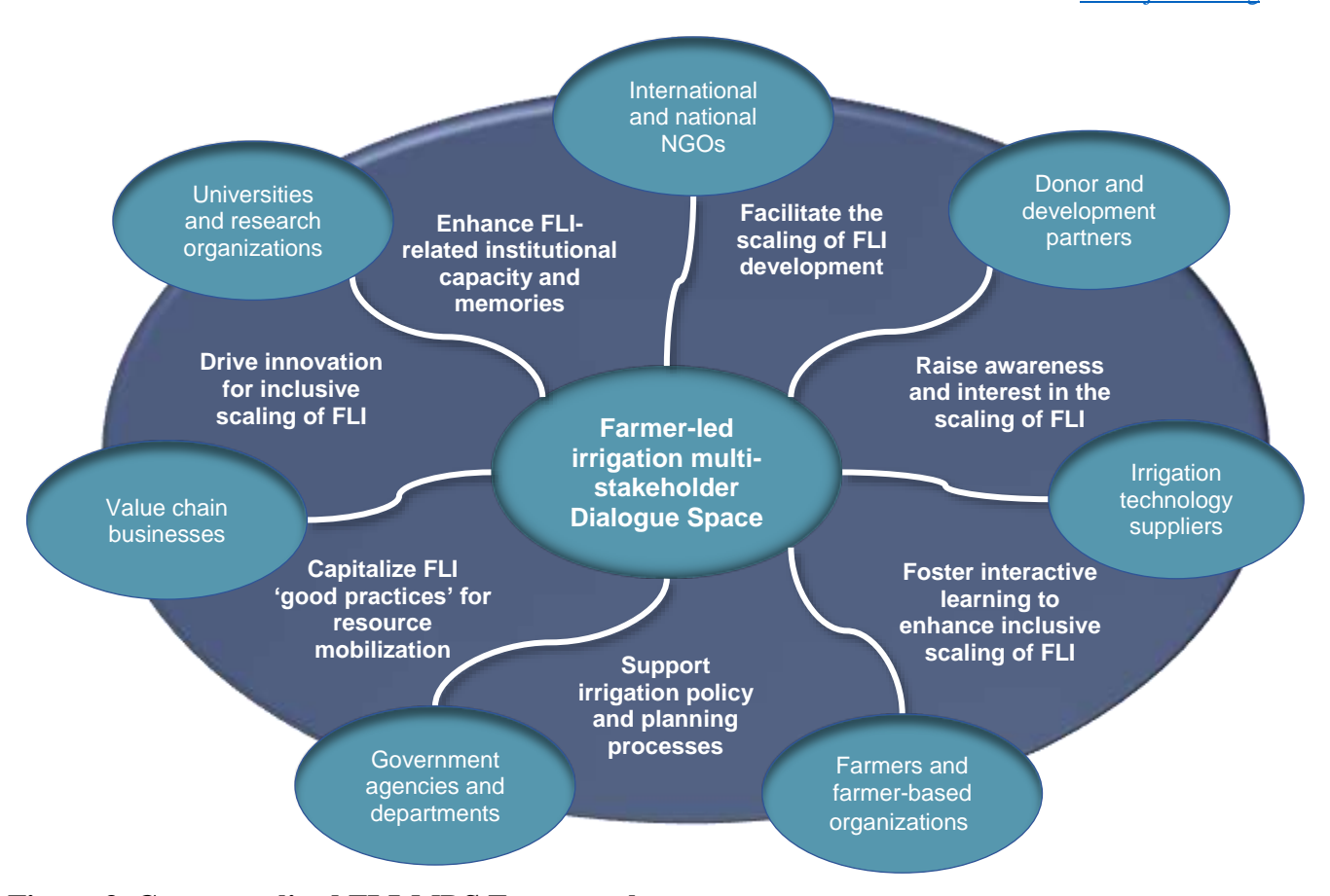
Figure 3. Conceptualized FLI-MDS Framework