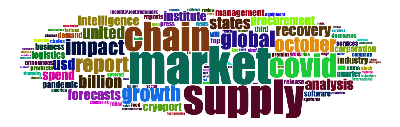
Figure 3.- Word cloud of the most common words found on the titles ProQuest's News Aggregator during October, 2020 (search keywords= 'supply chain + covid').