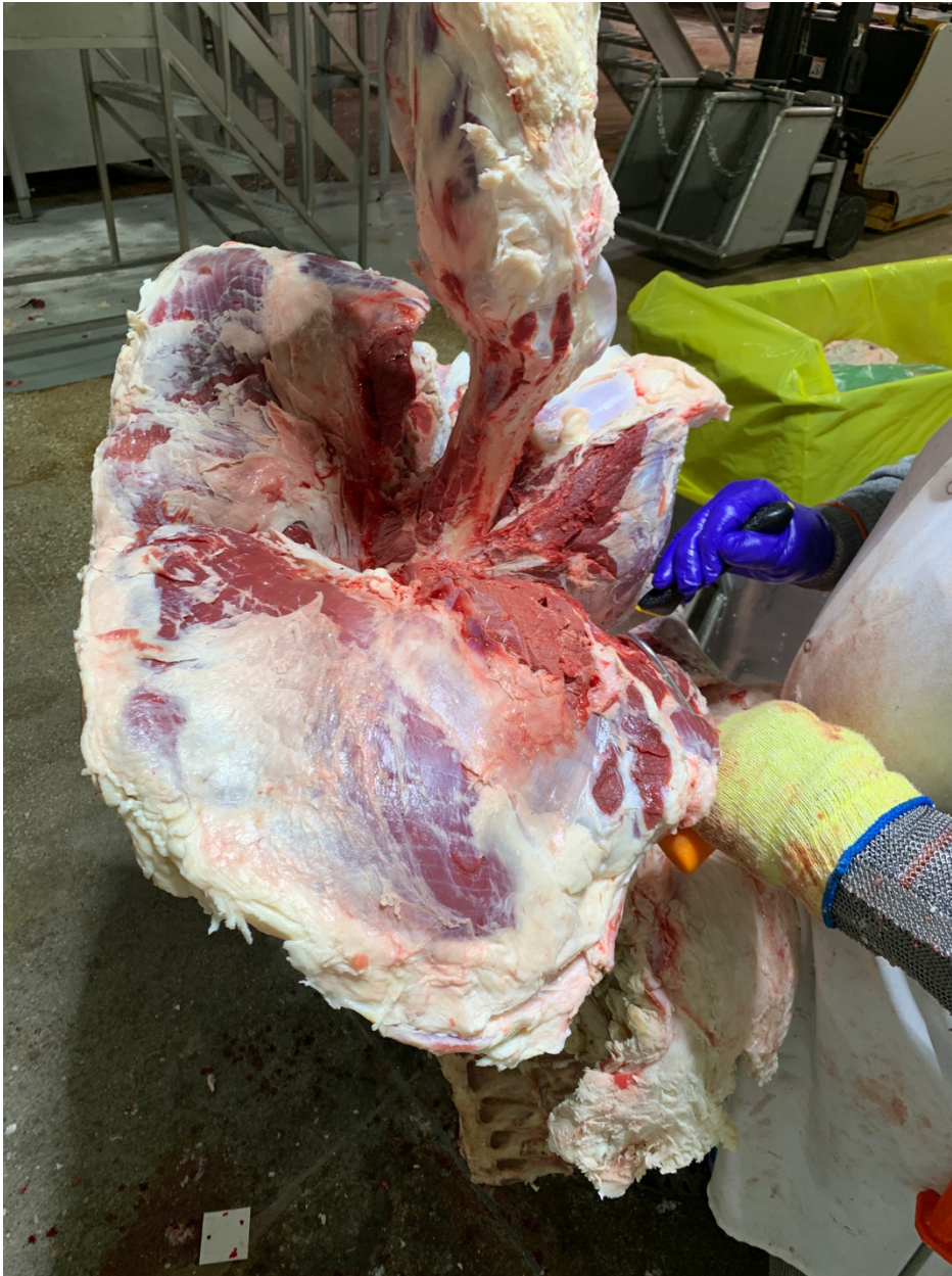
Figure 1. Selected hindquarter muscles removed at the natural seams