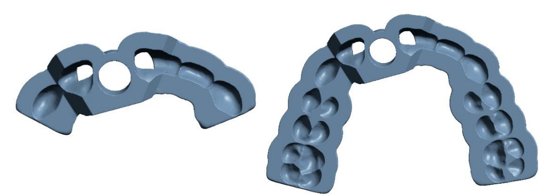
Figure 1. Surgical guide designs. Short guides (left) and long guides (right).

A total of twenty surgical guides were designed in implant planning software (Blue Sky Plan version 4.3.10; Blue Sky Bio, LLC) and edited in 3D mesh editing software (Meshmixer version 3.5.474; Autodesk, Inc.). The guide tube parameters used were those used clinically for 5mm T-sleeve (Straumann Group). Short and long guides were made identical in the inter-canine region, with the long guides extending distally to the first molars. Twenty surgical guides were fabricated by SLA 3D printer (Form 2; Formlabs Inc.) in a 3D printing resin material (Surgical Guide Resin; Formlabs Inc.), which is different from the one Marei et al<sup>9</sup> used in their study, because the resin material was introduced recently. The surgical guides were split into two groups (n = 10). One group (Group L) consisted of long-span guides which covered the maxillary arch from right first molar to left first molar. The other group (Group S) consisted of short-span guides that covered the maxillary arch from right canine to left canine. All the guides were designed for placing a single implant at the maxillary left central incisor position. No other teeth were missing. Figure 1 illustrates the short and long guide designs.