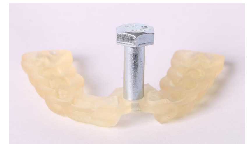
Figure 2. 3D printed surgical guide with stainless-steel bolt secured in the guide tube.

After printing, the guides were washed, cured, and the print supports were trimmed. For each guide, a stainless-steel bolt (6.35mm diameter) was selected that fit securely in the guide tube. The bolt was secured in the guide tube with light-cured resin to serve as an immutable reference between before and after (sterilization) scans. Figure 2 demonstrates how the bolts were inserted and fastened in the guide tubes.