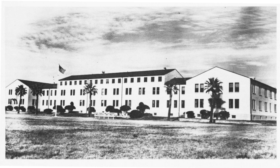
The Texas Maritime Academy

Principles and problems of leadership with special emphasis on applied psychology.