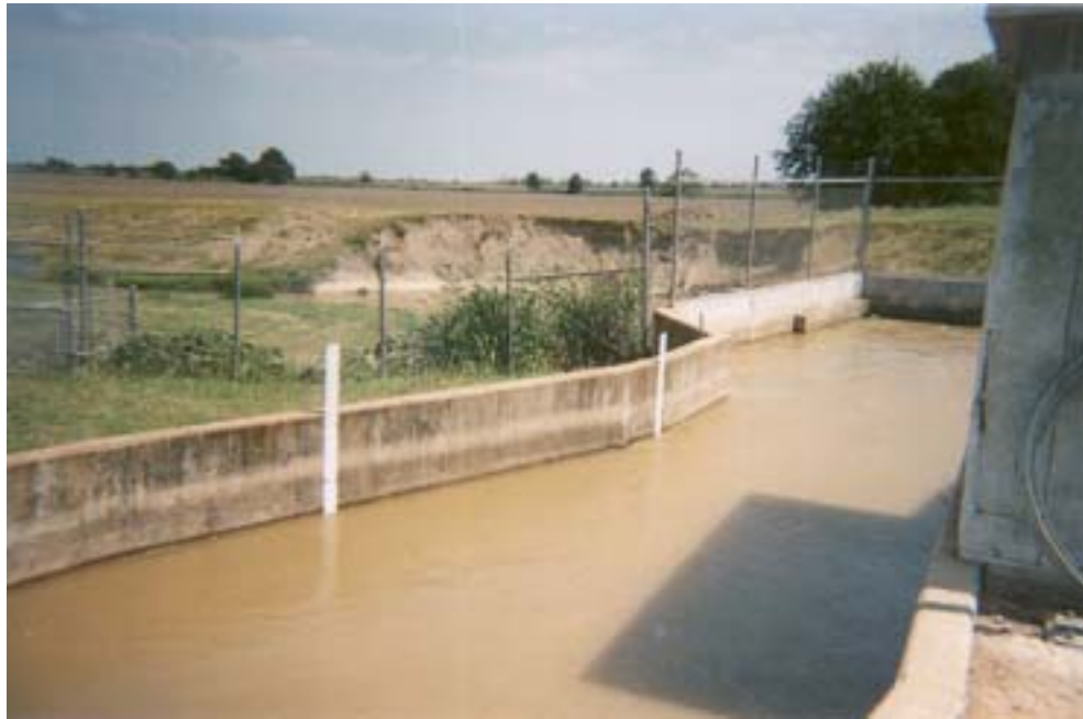
Figure 1: 10 foot Parshall flume and water level of flow measurement on May 16, 2003.

Milton Henry visited the site on April 11, 2003, met with Chad Elms, manager of the district, and provided preliminary assessment notes. The pump was not operating at this time, and a second visit was scheduled in order to observe the flume under normal conditions. Milton noted that no staff gages existed at the site.