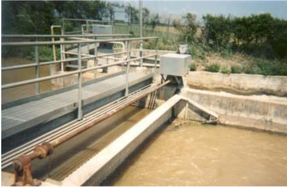
Figure 4: Shows above (figure 3) Radial Gate