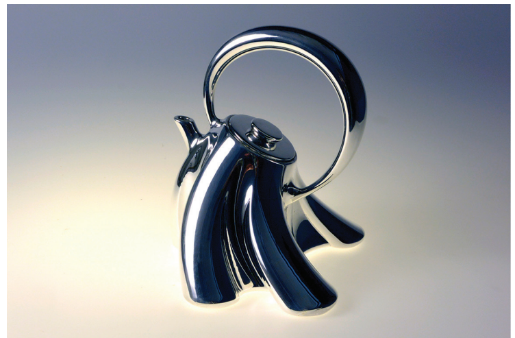
Fig. 1. The Modern Dowry teapot. Nylon polyamide, copper and sterling silver. 22.1 × 23.9 × 24 cm, 2017.