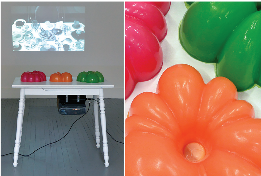
Fig. 3. Layer Chiffon (2017) silicone rubber, projector, various electronic components (Arduino, etc.) and table, 3 × 10 × 8 ft. Installed at Vassar College in 2017.

the molds using custom-tinted silicone rubber. Exhibit viewers could scan an individual doily which acted as a “QR” code and hyperlinked to a webpage infographic explaining its underlying statistics (Fig. 2b). As part of the exhibit, a few of the doilies were displayed on a table. A surprisingly high number of guests touched or picked up the silicone pieces off the table, which inspired the use of silicone forms as sensors in Layer Chiffon .