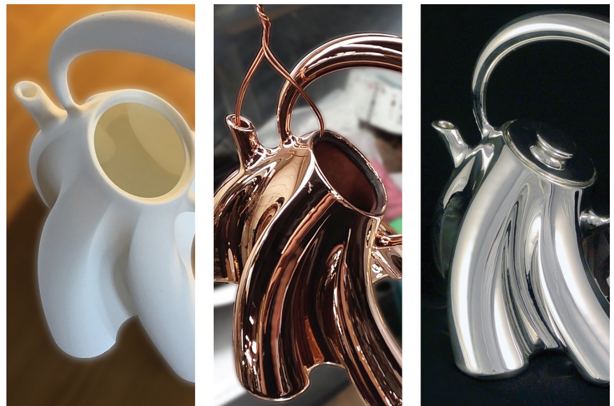
Fig. 4. Details of the teapot (from left to right) in SLS nylon polyamide, copper electroform and silver plate.

Initially inspired by John Crawford's 1825 teapot in The Museum of the City of New York's collection, the choice to work with the teapot compliments our backgrounds in art, design and computer graphics. The teapot has iconic significance in multiple realms: the Utah teapot in computer graphics and the sterling silver teapot as a status symbol and a literal representation of wealth in Colonial America. Modern Dowry references the iconic status of the teapot in multiple domains and represents a fresh approach to object-making by combining the relevant tools and techniques with contemporary context.