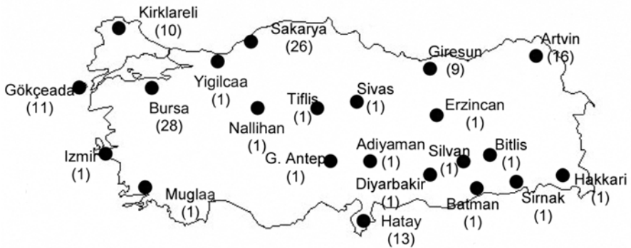
Fig. 1. Sampling locations in seven geographical regions of Turkey for Apis mellifera "C" lineage, and A. m. syriaca and the number of colonies (n) from each sample location.

DNA sequences were aligned with CLUSTAL W (Thompson et al. 1994) using Bioedit v5.0.7 (Hall 1999). Number of mitotypes and their frequencies were determined both visually and with the program DNAsp version