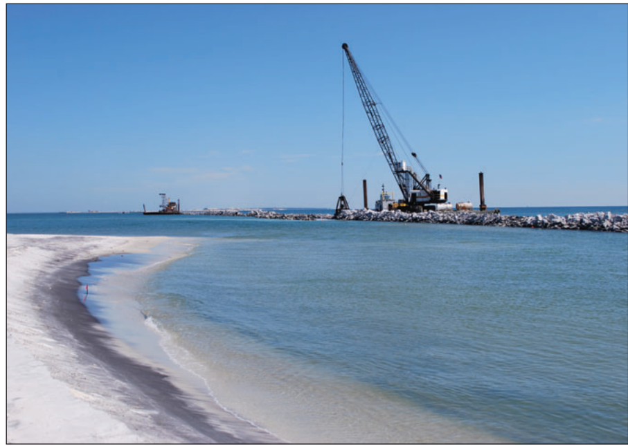
Figure 3. Crews blockade the inlet with riprap at Katrina Cut on Dauphin Island, Alabama. This view is from the uninhabited west end of the island, looking across the inlet toward the heavily developed east end.

routes are possible whenever local hydrology is manipulated (Chaibi and Sedrati 2009). The reduction of inlet volume decreases the exchange of water and sediments during tides (Kraus and Militello 1999). This, in turn, affects flow velocities, typically resulting in scouring along bank margins, while near-shore wave dynamics often change as well (Komar 1996). The closing of inlets can modify the salinity, oxygen level, and turbidity of back bays. Associated ecosystems often experience large fish kills or other radical shifts toward new ecological states, as physical and chemical parameters adjust to a decrease in mixing throughout the water column (Goodwin 1996). If inlet restriction is absolutely necessary, it should aim to minimize the impacts on local hydrology and ecosystem function.