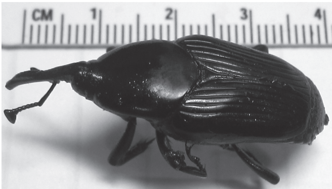
Fig. 2. Rhynchophorus palmarum male from Alamo, Texas.