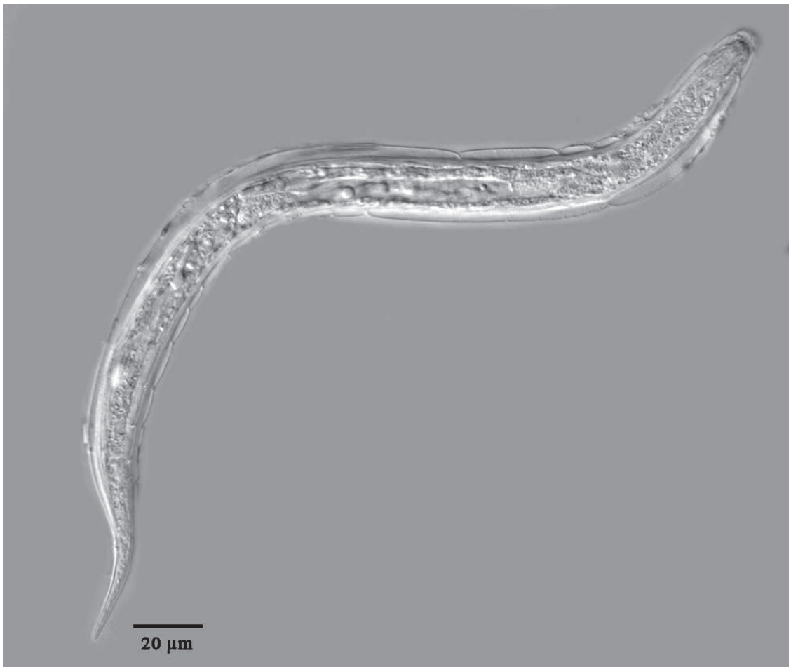
Fig. 4. Dauer juvenile diplogastrid nematode (Unidentified Rhabditida) from Rhynchophorus palmarum showing bunched, sticky outer cuticle, differential interference contrast optics.

marum can be easily established in subtropical environmental conditions, especially with the presence of the wide variety of host plants found in the Lower Rio Grande Valley including several ornamental palms, coconut and oil palms, and sugarcane. Secondly, if R. palmarum does become successfully established, it could be moved to the rest of the southern U.S., affect the ornamental palm industry, and infest and negatively impact sugarcane plantations in South Texas, Louisiana, and Florida. Finally, this weevil is a vector of red ring nematode B. cocophilus , which causes red ring disease that is lethal to many palm tree species, and that further increases economic damage to commercial palm plantations and urban landscapes.