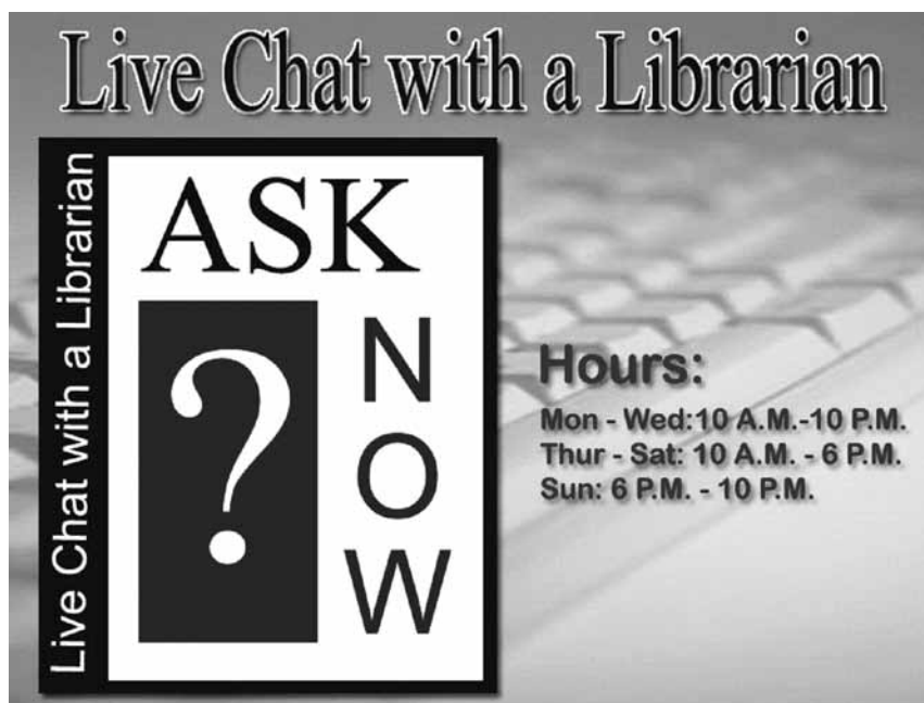
Figure 2. Screen Saver and Bus Logo

The annual Aggie Fish Camp presented another opportunity to promote the ASK NOW service. Fish Camp is a four day orientation