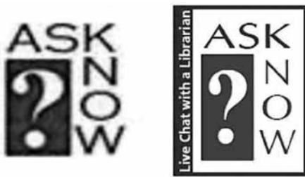
Figure 1. Before & After ASK NOW Logos

While this review reveals some evidence that marketing is beneficial, it demonstrates the need for a more systematic and quantitative analysis of marketing campaigns. Being able to compare pre- and post-marketing statistics over time would certainly add to the evaluation of the chat process. Unfortunately, little empirical evidence exists on the effectiveness of marketing campaigns or their individual components. The purpose of this study is to provide some empirical evidence to support the efficacy of marketing a virtual reference service.