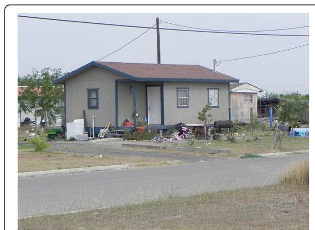
Figure 2 Colonias residence with physical activity opportunities.

Children reported their perceptions of social support received from their parents and mothers reported perceptions of their provision of social support to their children. Children's perceptions of parental social support for physical activity were measured with three items using a 7-point Likert scale of frequency to understand how often social support (in the form of parents being physically active with their children, encouraging their children to be physically active, and providing transportation for physical activity) was provided in the previous seven days (0-7 times) [38,39]. Provision of social support for children's physical activity was also examined using 3 items to measure the frequency of the mother's demonstration of social support for her child. These items were adapted from Trost and colleagues' (2003) original five-item scale [40]. Specifically, items ascertained whether the mother reported supplying transportation to and from physical activity/sport options for her child, exercising with her child, or orally reinforcing that physical activity is "beneficial" or "good" to her child. Although Trost's original scale used a 5-point Likert scale ranging from "none" to "daily", in this study each mother reported how many times she provided these types of social support to her child in the previous seven days (0-7). Possible summative scores for both mothers' provision of social support and children's receipt of social support ranged from 0-21.