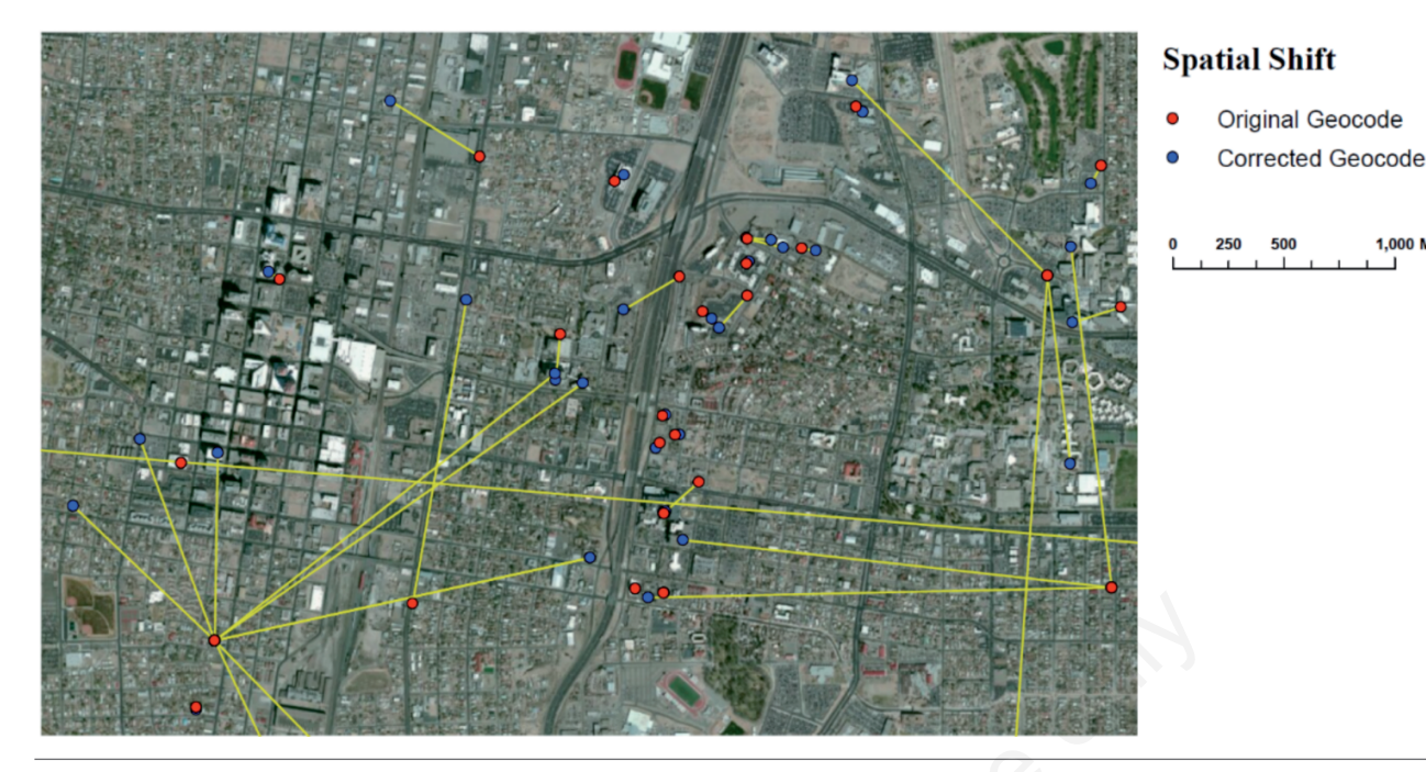
Figure 3. Spatial shift from original geocode to corrected geocode.