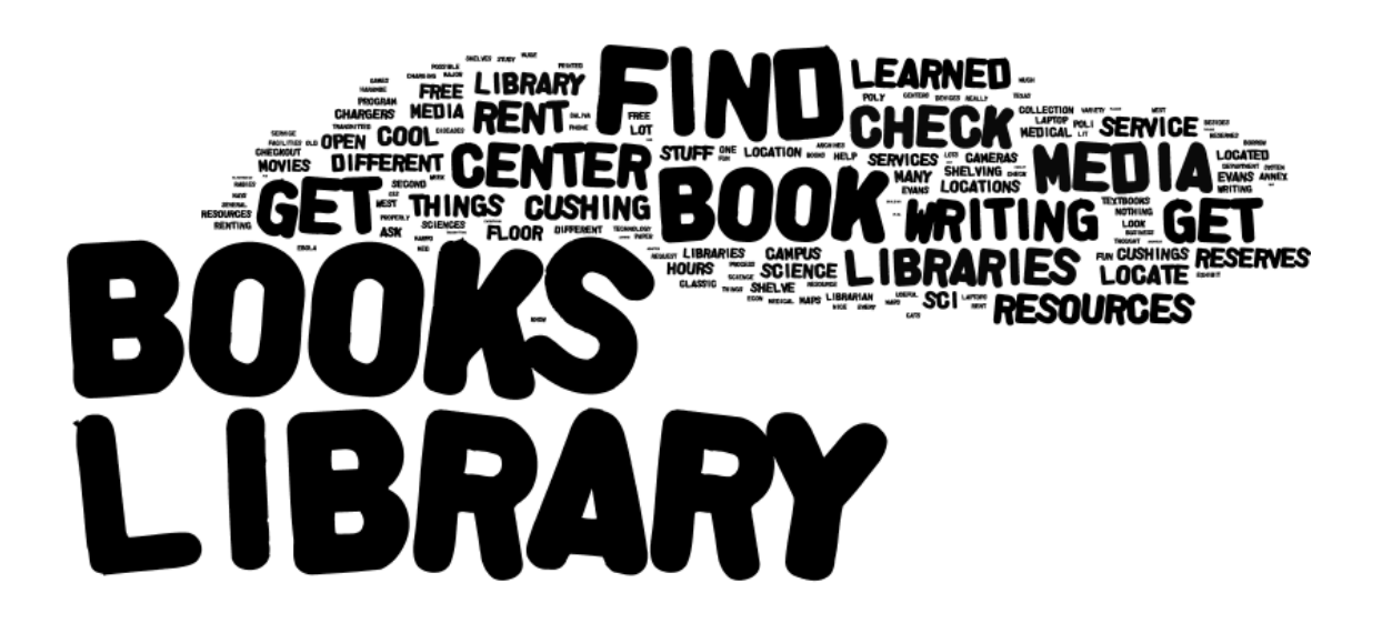
Figure 3: What Did You Learn at Open House Word Cloud (created with wordle.com)

to include, highlight, and promote for future events, but it was also useful for demonstrating the value of the booths to booth leaders, volunteers, and other stakeholders.