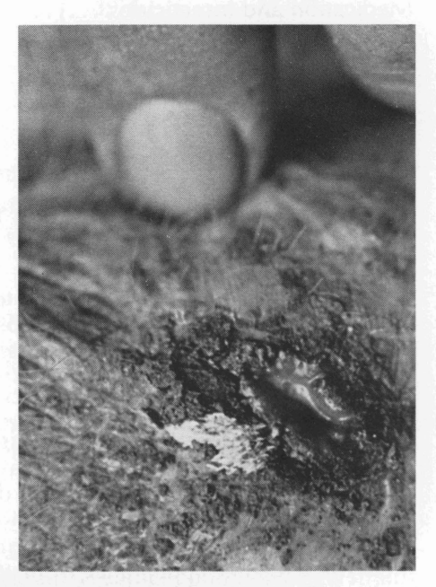
Figure 2. Mature screwworm larvae.

Figure 1. Screwworm wound with newly deposited eggs.