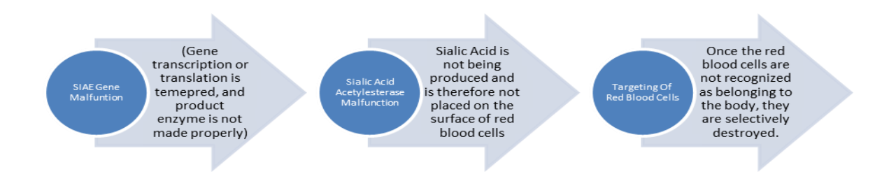
Figure 3 This figure explains my hypothesis about what I propose is going on in the case of patients with hemolytic anemia.

this is causing red blood cells to lack sialic acid. The lack of sialic acid is causing red blood cells to appear foreign to our own immune system, which leads to an attack and depletion of red blood cells in the body. Thus, even though there is no actual physical blood loss, patients are diagnosed with low levels of hemoglobin. Blood transfusions are a popular answer to this problem, but are simply prolonging the true problem.