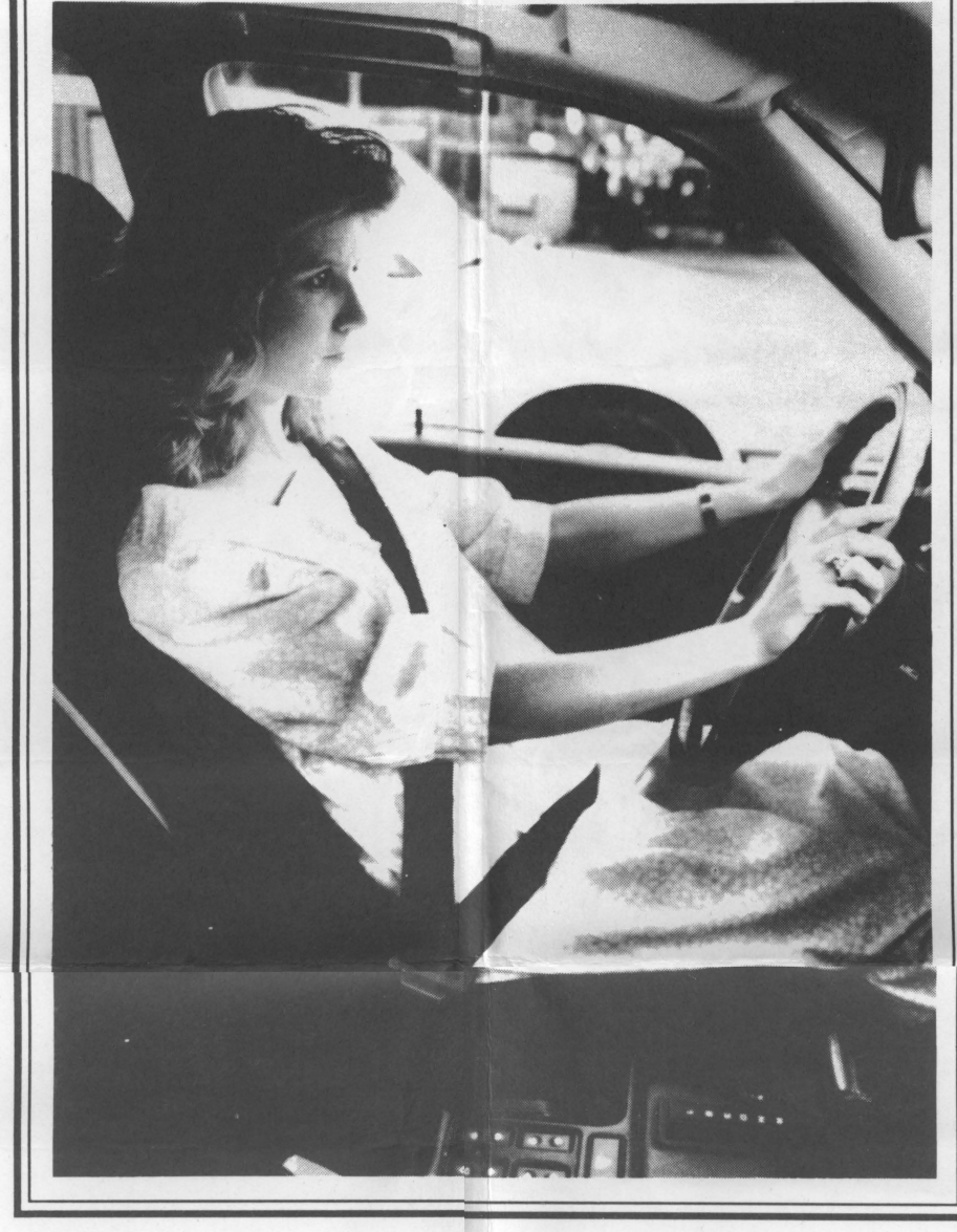
Be Safe for Two! Use lap-shoulder belt low and snug.