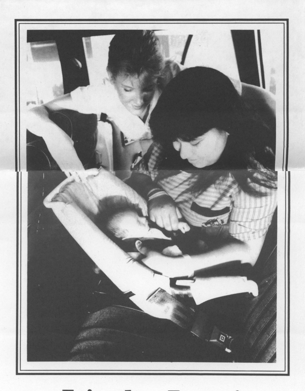
It's the Law! Take your baby home in an approved infant safety seat.