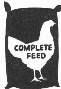
2. Feed hens a complete feed.