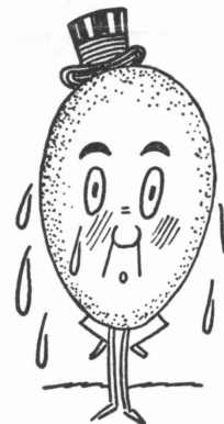
4. Remove animal heat from eggs as soon as possible