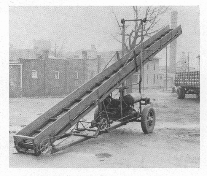
Baled hay elevator for lifting bales into the barn.