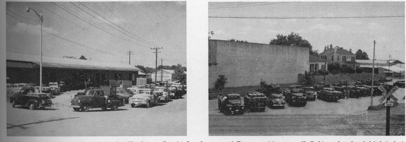
Figure 1. Tomato producers in the Northeast Sandy Lands area of Texas waiting to sell (left) and unload (right) their green-wrap tomatoes at a typical market.

Pink tomatoes generally were purchased on the basis of two grades established by the packer. Producers were paid for the pounds of tomatoes