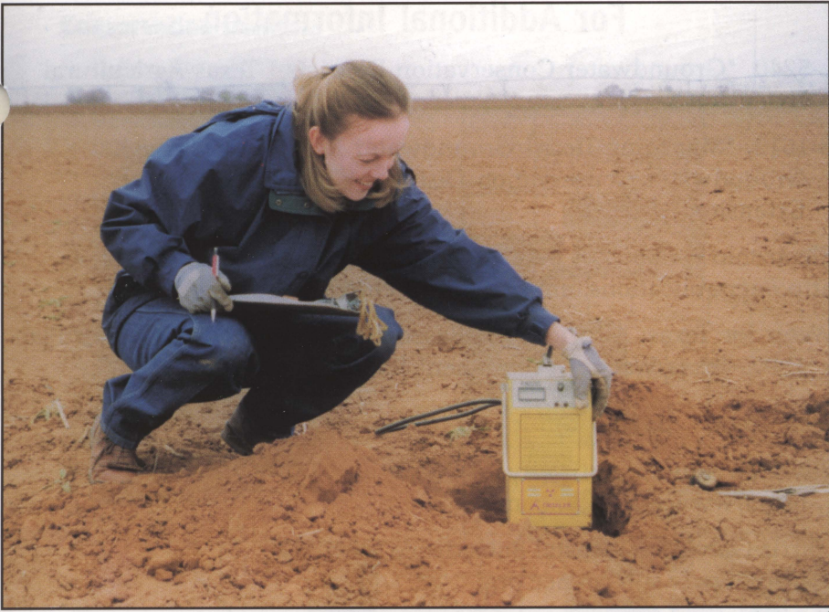
A moisture meter is used to collect pre-plant soil moisture data. This information helps producers know how much to irrigate before planting.

The Texas Water Code, Chapter 36, allows groundwater districts to levy property taxes to pay maintenance and operating expenses at a rate not to exceed 50 cents on each $100 of assessed valuation. Most district activities are funded through these ad valorem taxes, for which the maximum tax rates are set by local election. Districts surveyed reported ad valorem tax rates of $0.0045 to $0.0575 per $100 valuation. Hence, the annual tax paid on property valued at $100,000 ranges from $4.50 to $57.50.