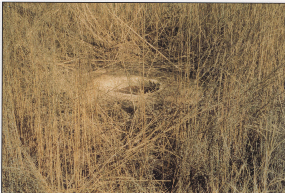
This open, abandoned irrigation well is well hidden on CRP land. Groundwater Conservation Districts work to make sure abandoned wells are properly capped to prevent accidents and aquifer contamination.

Groundwater Conservation Districts vary in size, from partial county or single county districts to multiple county districts. Staffing levels vary from one part-time position to several full-time positions, depending upon the goals of the Boards of Directors and the contributions of the local taxpayers.