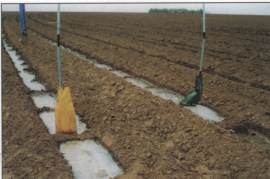
Using agricultural water conservation techniques, such as low energy precision application (LEPA) center pivot sprinklers and furrow diking, improves irrigation efficiency and conserves groundwater.

Groundwater Conservation Districts can provide a range of technical support services to help water users with conservation. Such services include monitoring precipitation and aquifer water levels. Several districts test wells, pump plant efficiency, and irrigation system efficiency. Water quality testing can vary from biological evaluations (coliform and fecal coliform bacteria) to more complete water quality analyses (including alkalinity, hardness, chloride, specific conductivity, total dissolved solids, fluoride, iron, ammonia, nitrate, sulfate and pH.) In some districts, water analysis is offered free of charge to residents of the district, and may be offered on a fee basis to residents outside the district. For specific information on water analysis services and fees, residents should contact their districts.