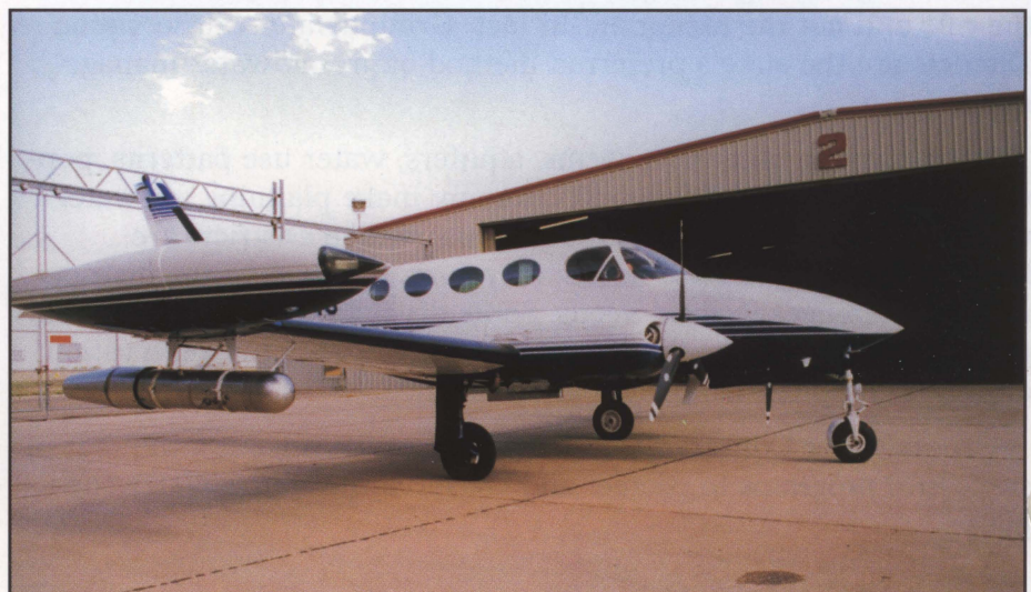
This Cessna 340 aircraft, equipped with belly racks and wingtip generators, is used for cloud seeding by three Groundwater Conservation Districts in the Texas High Plains.

Groundwater Conservation Districts use a variety of programs and media to inform the public about water issues and to raise public awareness of the need for water conservation. News releases and public service announcements distributed through newspapers, radio