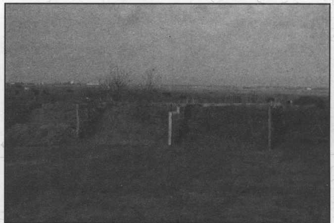
A simple, well-managed composting system is visually appealing and is unlikely to cause water quality problems.

The moisture content of the manure and bedding is normally 50 to 60 percent in the raw state, so additional moisture probably will be unnecessary until the compost is moved to the second or third bin. Have an ample water supply and pressure to moisten the compost as it is turned. Moisture content can drop as low as 25 percent within 4 weeks. To increase the moisture content of compost from 25 percent to 55 percent, add about 20 to 30 gallons of water per 100 cubic feet of compost. For a system in which four bins (1,000 cubic feet each) require additional moisture, approximately 1,200 gallons of water are needed every time the bins are turned. However, the actual amount of water needed will vary substantially depending on the kind of bedding used, the size of the particles in the bedding and other site-specific factors.