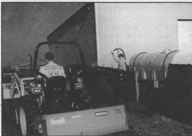
Supplemental water can be sprayed into compost bins from a trailer-mounted tank as the material in each bin is turned and moved.

A better method of determining compost maturity is based on the rate of microbial respiration or gas exchange. Respirometry-based maturity tests create standardized moisture and aeration conditions within a compost matrix, and then measure oxygen consumption or carbon dioxide pro-