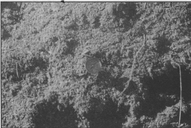
The 139-degree F reading on this long-stemmed thermometer confirms that thermophilic composting is underway.

Measure temperatures at least daily for the first week after the compost has been turned. Then, if temperatures in active bins are in the thermophilic range between 130 degrees and 160 degrees F, the time between measurements may be increased. Temperatures immediately after turning and wetting obviously will be near air temperature, but they should rebound markedly within 48 hours.