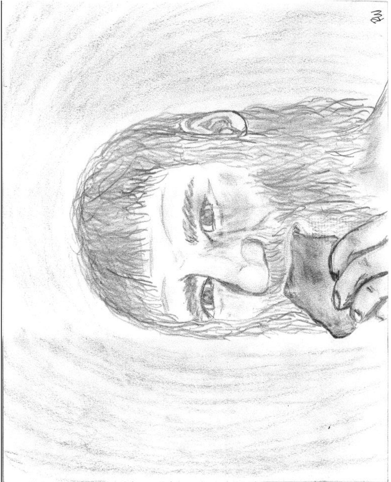
Figure 3. The Eucharist.