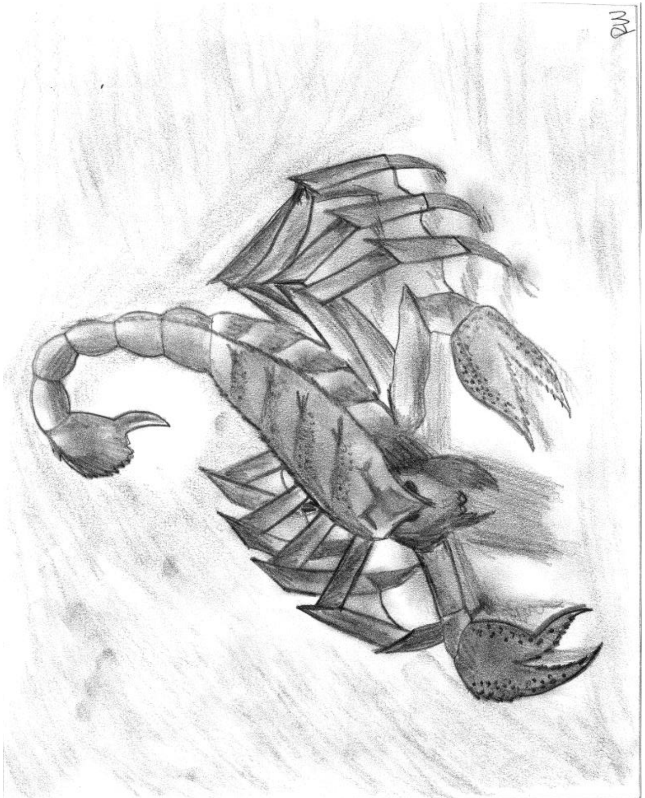
Figure 4. The Crucifixion.