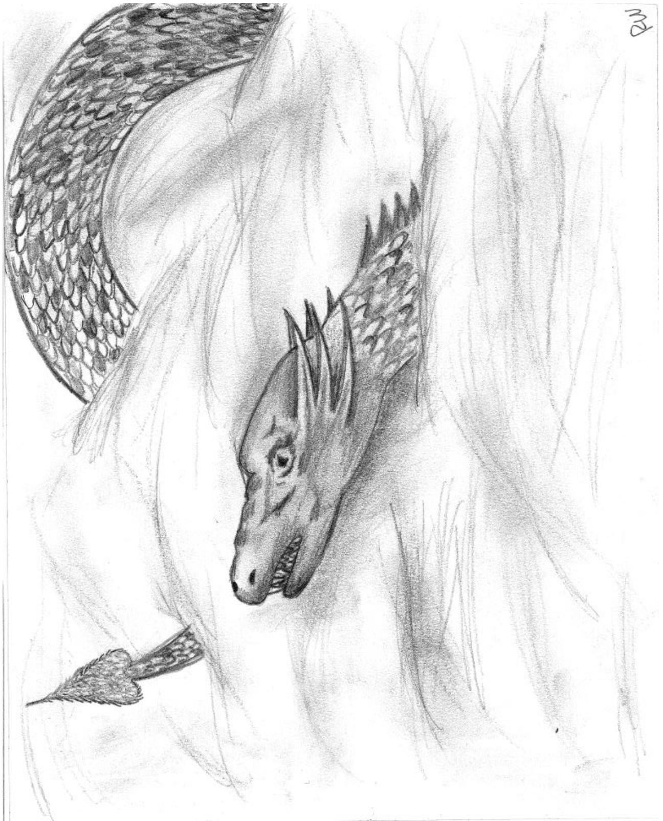
Figure 1. The Serpent.