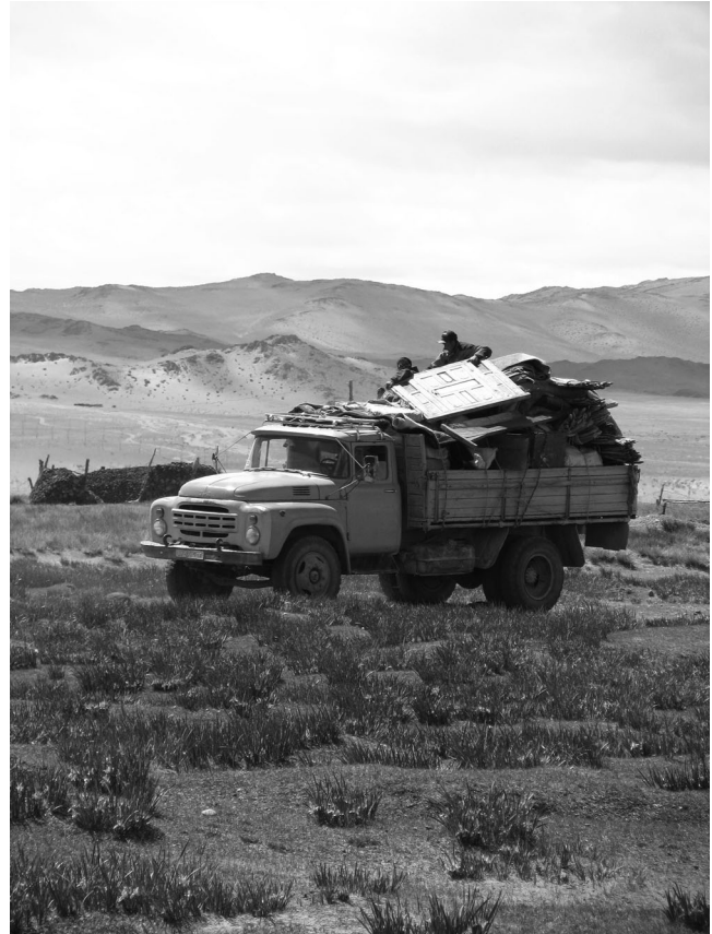
FIGURE 2. A seminomadic family uses a truck to transport their yurt and household belongings to their summer pasture, June 6, 2009.

Our field research was conducted among the Kazakhs of western Mongolia over the course of three summers (2006, 2008, and 2009). We conducted interviews in multiple locations as a way to capture the diverse experiences of rural and urban Kazakhs. Most of our interviews and ethnographically informed surveys took place in Bayan-Ulgii province, in the central town of Ulgii (with a population of approximately 28,000), in three villages that serve as district centers (with populations ranging from 800 to 1,700), and in three mountain pastures used by seminomadic herders. During the summer of 2006, we also conducted preliminary interviews in Khovd province and one additional summer pasture location in Bayan-Ulgii province. In each location, we employed local research assistants and participated in the daily lives of