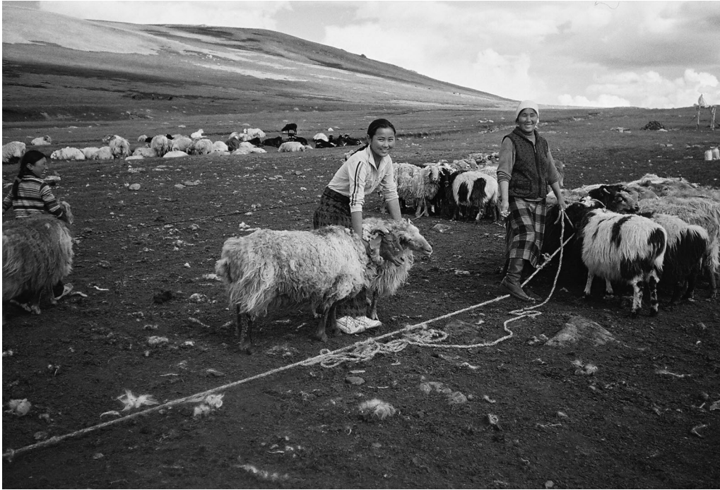
FIGURE 4. A woman prepares goats for milking with the help of her two daughters, July 26, 2006.

The following summer, after losing approximately 30 percent of their livestock in a bad winter freeze ( zhut ), Talgat and Gulzhan lamented that life in Mongolia had simply worn them down. Olzhas's continued declaration to provide help upon their arrival in Kazakhstan was a critical factor in their eventual decision to migrate. These examples illustrate how men and women have different desires, expectations, and opportunities in regard to migration and how older men in particular have more authority and influence when it comes to decisions to migrate.