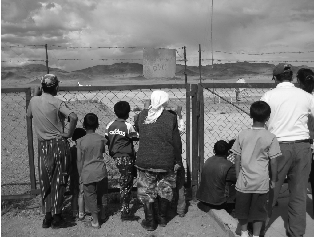
FIGURE 5. Family members wait for the arrival of the weekly flights from Almaty and Ustkamen, Kazakhstan, to Ulgii, Mongolia, July 8, 2009.

travelling with his wife, and a man is only expected to bring gifts to his closest relatives if he is travelling alone. In comparison, women are expected to bring a gift to every household that they visit, whether or not they are travelling with their husband. So, women who can afford a transnational visit are either burdened with the higher cost of providing more gifts or burdened with the shame of not fulfilling cultural expectations. These examples illustrate how migration outcomes and experiences vary by gender. Several features of the Kazakh kinship system influence the migration process in a way that often widens the physical separation between women and their natal kin. Further, gendered expectations about guesting and gifting can increase the cost of return visits for women.