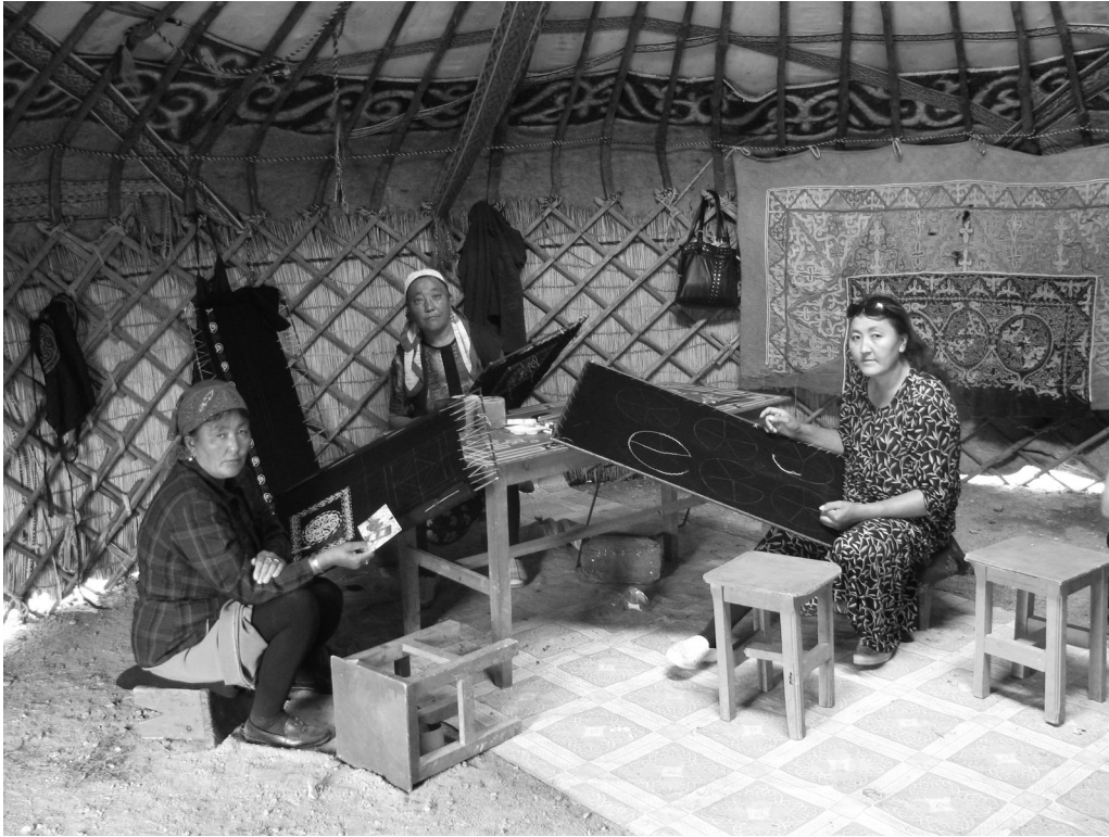
FIGURE 3. These women earn money through the sale of textiles to international tourists, July 24, 2008.

Turkic-based language, and many Kazakhstani Kazakhs are bilingual (to varying degrees) in Kazakh and Russian.